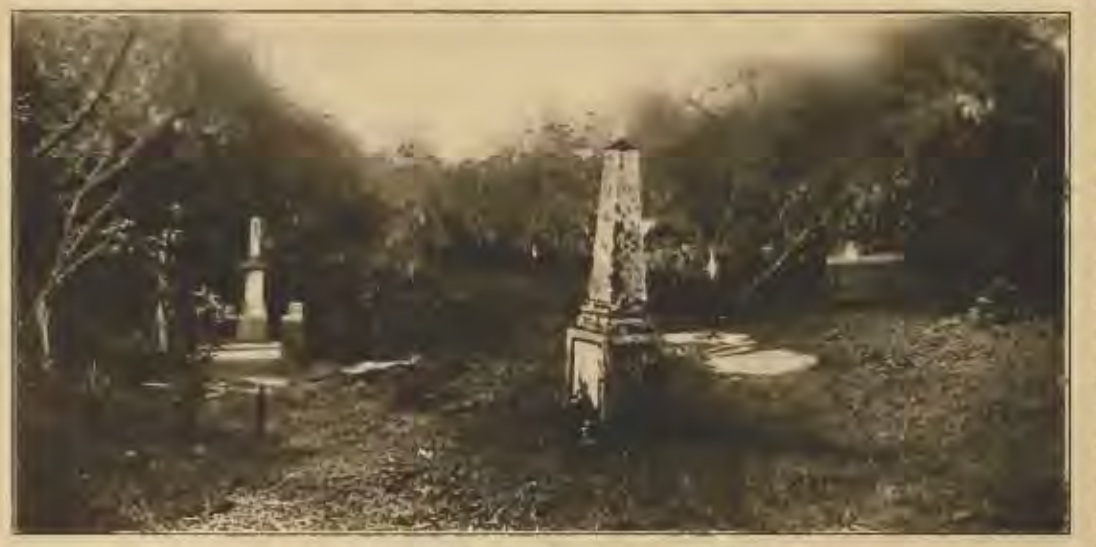
A CORNER OF MOUNT HOPE CEMETERY Names of forgotten French martyrs are carved in the stones

ment of the Panama iokers the rates were adopted and, what was more amazing, they remained unchanged for twenty years. During that time the company paid dividends of 24%, with an occasional stock dividend and liberal additions to the surplus. stock at one time went up to 335 and as in its darkest days it could have been bought for a song those who had