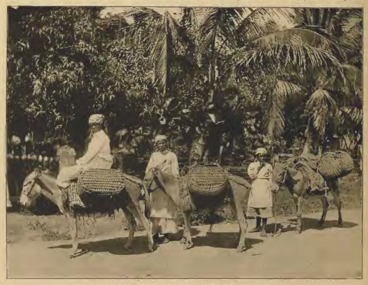
MARKET WOMEN AND THEIR DONKEYS The true industrial forces of Jamaica. Men are seldom seen as carriers or sellers of produce

open air, adds to the gayety of life by grouping so many black families in one corral, reduces the high cost of living as our model tenements never can hope to, but makes one black landlord independent, for the possession of a yard with its rooms all rented leaves nothing needed for enjoyment except a