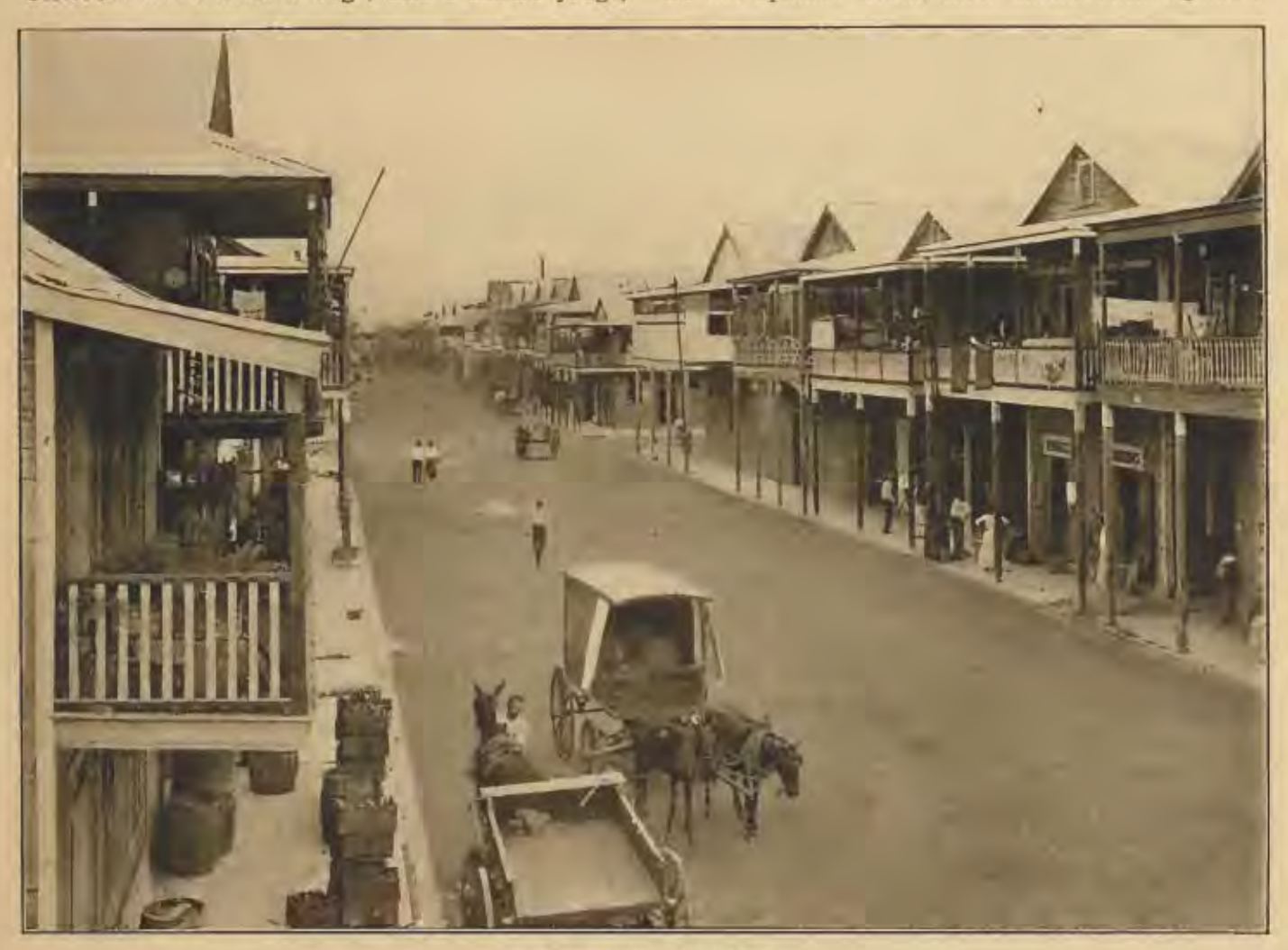
D STREET, COLON, PAVED Before being sewered and paved this street was as bad as Bottle Alley on preceding page

group of children, among whom even the casual observer will detect Spanish, Chinese, Indian and negro types pure, and varying amalgamations of all playing together in the childish good fellowship which obliterates all racial hostilities. The Chinese are the chief business people of the town, and though they intermarry but little with the few families of the old Spanish strain, their unions both legalized