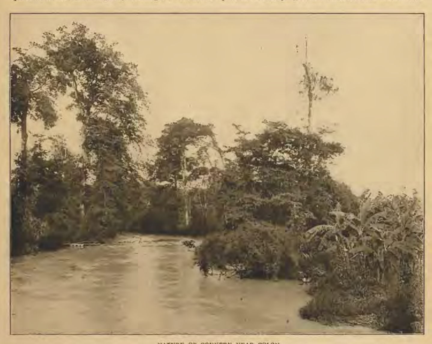
NATURE OF COUNTRY NEAR COLON . Through this water-logged region the Panama railroad was built at heavy cost in money and lives

shrubs defying entrance even to the wild beasts common to the country. In the black slimy mud of its surface alligators and other reptiles abounded, while the air was laden with pestilential vapors and swarming with sandflies and mosquitoes. These last proved so annoying to the laborers that unless their