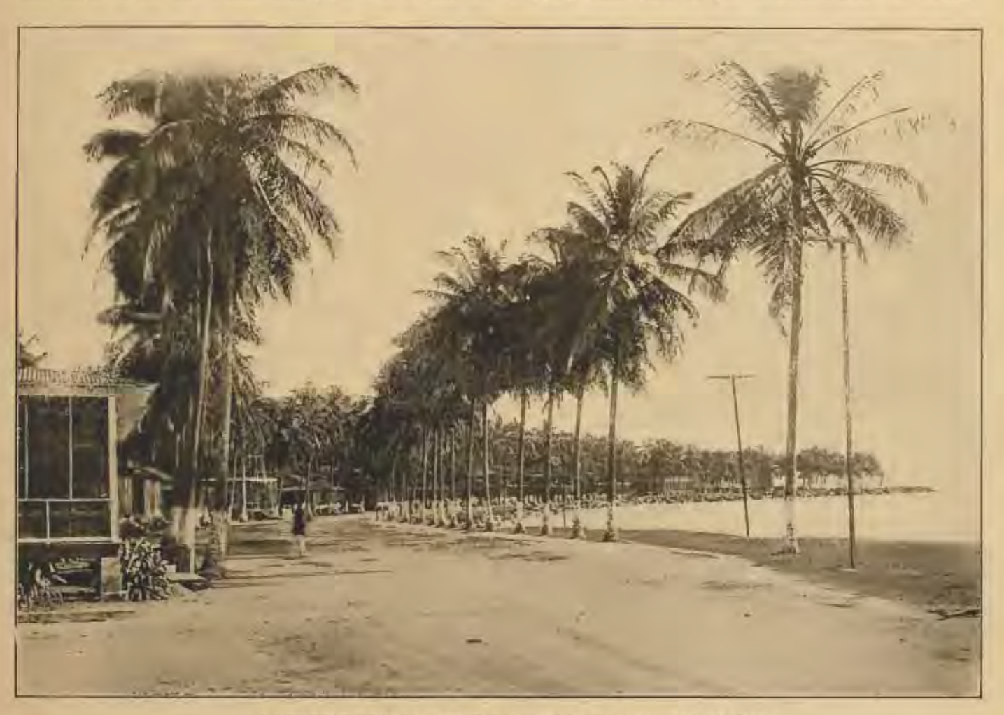
ROOSEVELT AVENUE, CRISTOBAL, ABOUT TO LOSE ITS BEAUTY

white foam upon the shore, unlike the Pacific which is usually calm. Unlike the Pacific, too, the tide is inconsiderable. At Panama it rises and falls from seventeen to twenty feet, and, retiring, leaves long expanses of unsightly mud flats, but the Caribbean always plays its part in the landscape well. Unhappily this picturesque street—called Roosevelt