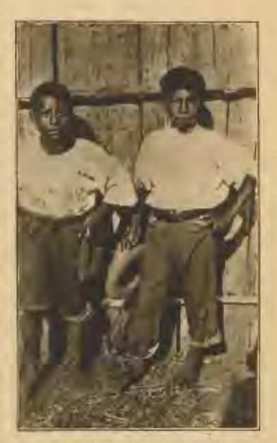
SAN BLAS INDIAN BOYS

center of the Isthmus. But though the French failed to dig the Canal they did win popularity on the Isthmus, and there are regretful and uncomplimentary comparisons drawn in the cafés and other meeting-places between the thrift and calculation of the Americans, and the lavish prodigality of the French. Everything they bought was at mining-camp prices and they adopted no such plan as the commissary system now in