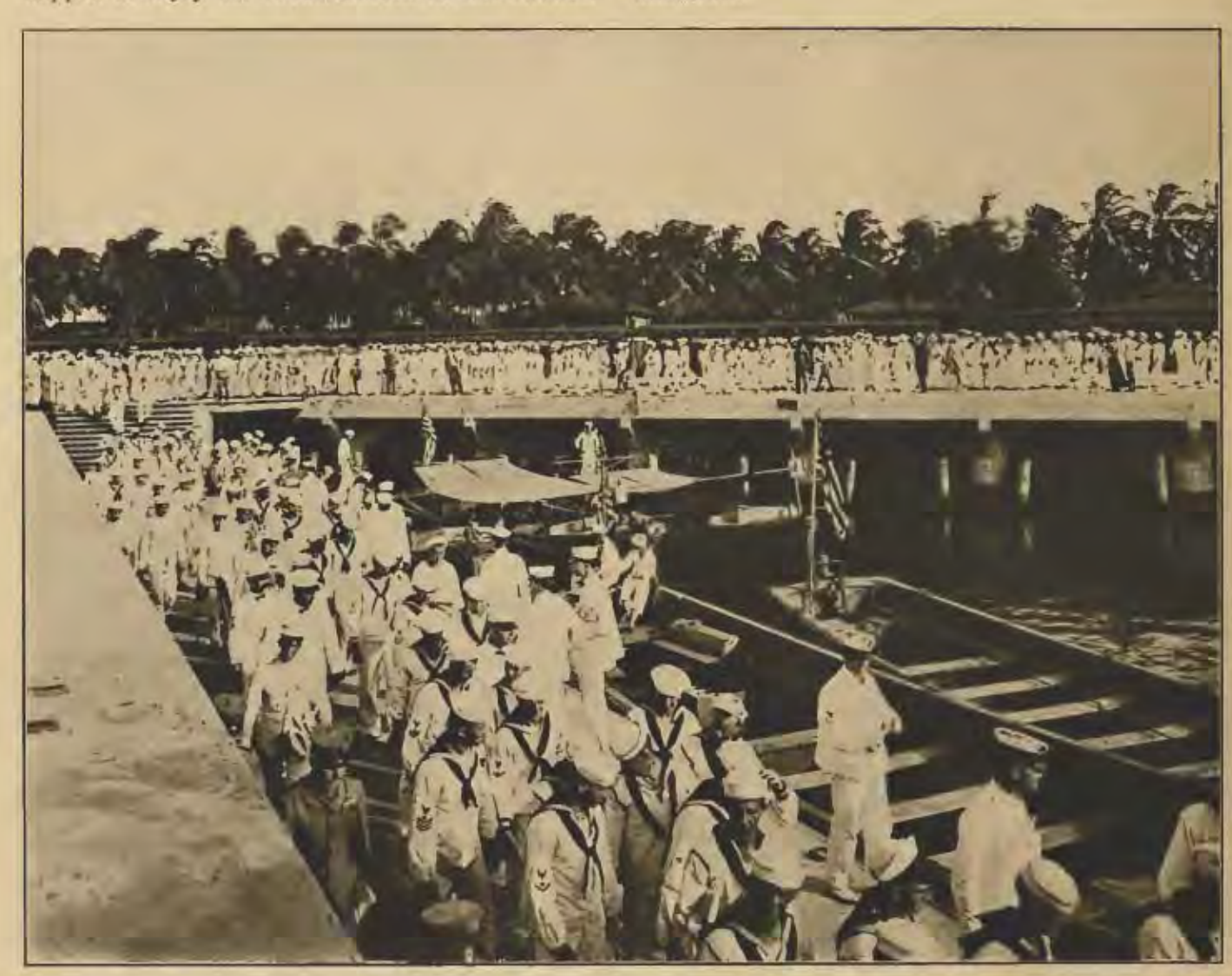
THE ATLANTIC PLEET VISITS THE ISTHMUS

Vice flourished. Gambling of every kind and every other form of wickedness were common day and night. The blush of shame became practically unknown."