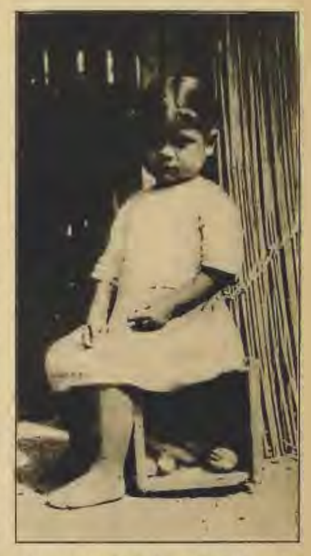
CHILDISH BEAUTY WITHOUT ART

Traffic for the road grew faster than the road itself and when it was completed it was quite apparent that it was not equipped to handle the business that awaited it. Accordingly the managers determined to charge more than the traffic would bear-to fix such rates as would be prohibitive until they could get the road suitably equipped. Mr. Tracy Robinson