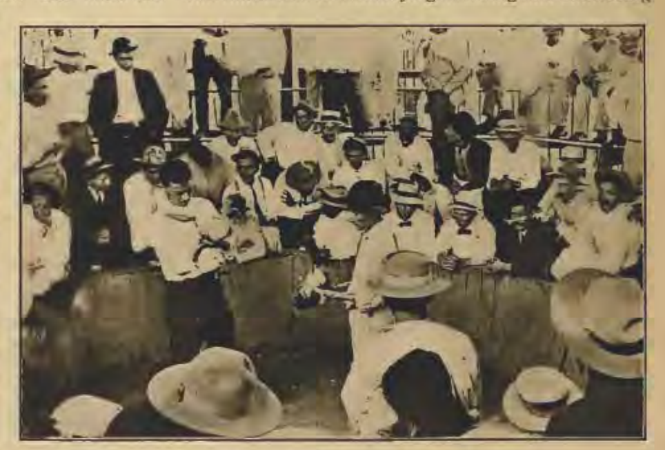
THE NATIONAL GAME-COCK-FIGHTING

were the rule and scarcely discouraged. "Monkey Hill" was the original name of the place, owing to the multitude of monkeys gamboling and chattering