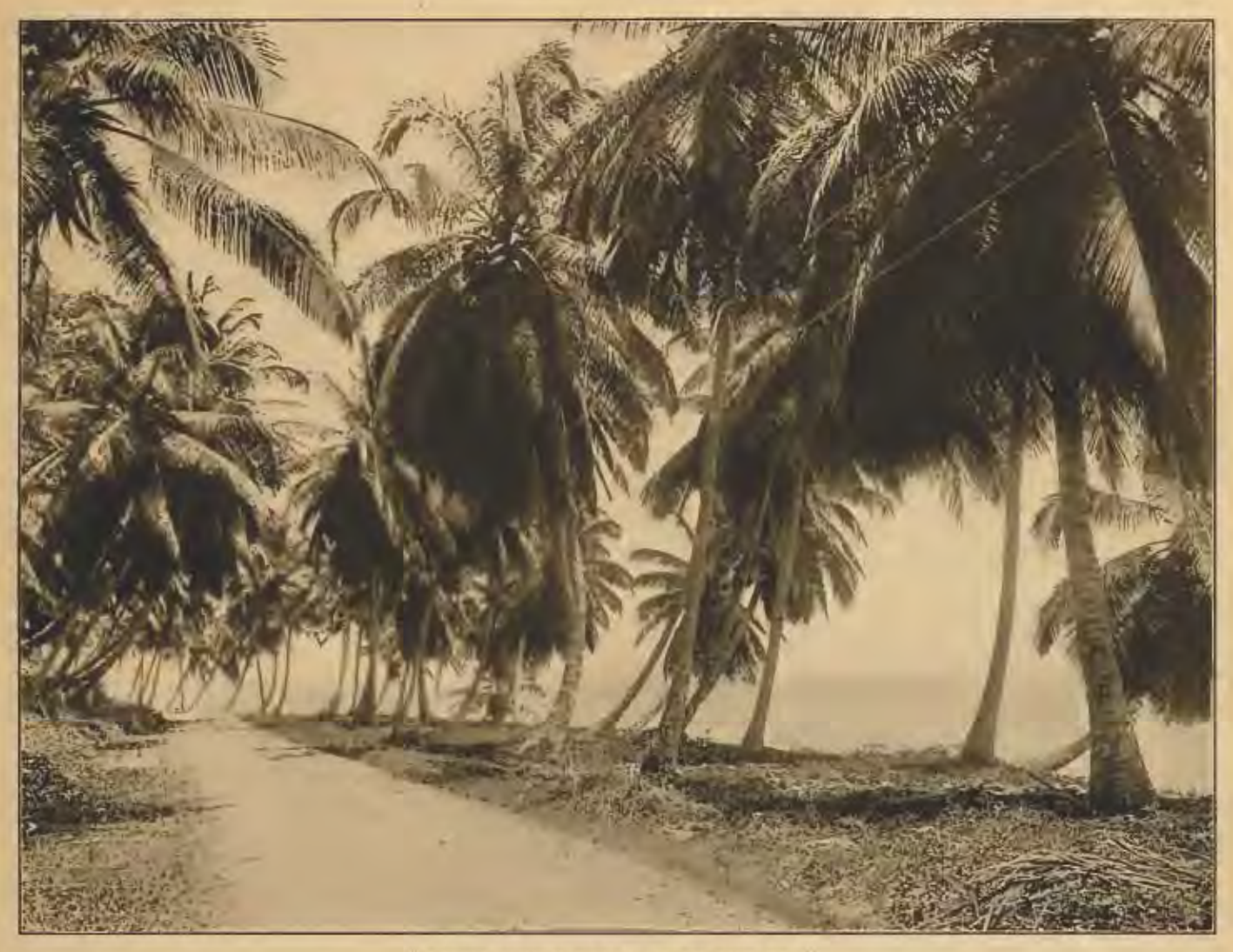
"PALMS WHICH BLEND WITH THE SEA"

I go on to Colon and by thunder dere is no Colon. Nothing but mud." It is recorded that the skipper's explanation was accepted and that he was acquitted of wilfully casting away his vessel.