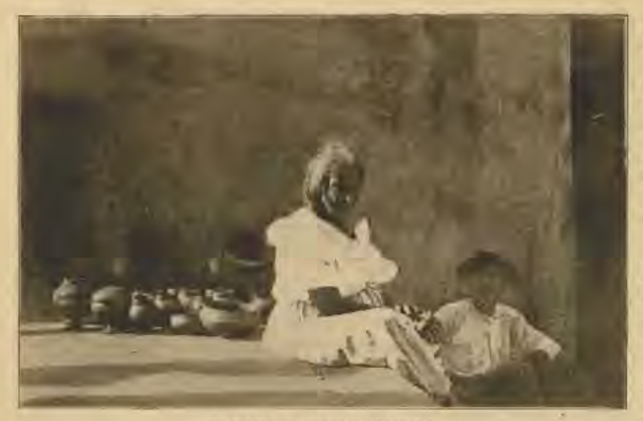
PANAMA POTTERY SELLERS

hotel, while directly across the way the finishing touches were being put to a new hotel, of reinforced concrete which for architectural taste and beauty of position compares well with any seashore house in the world. At the docks were ships of every nation; cables kept us in communication with all civilized capitals. Not an insect of any sort was seen, and to discover an alligator a considerable journey was necessary. The completed Panama Railroad would carry us in three hours to the Pacific, where the great water routes spread out again like a fan. In half a century man had wrought this change, and