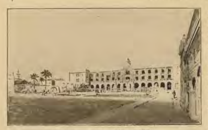
THE NEW WASHINGTON HOTEL

which the town stands, and to which it is prac-