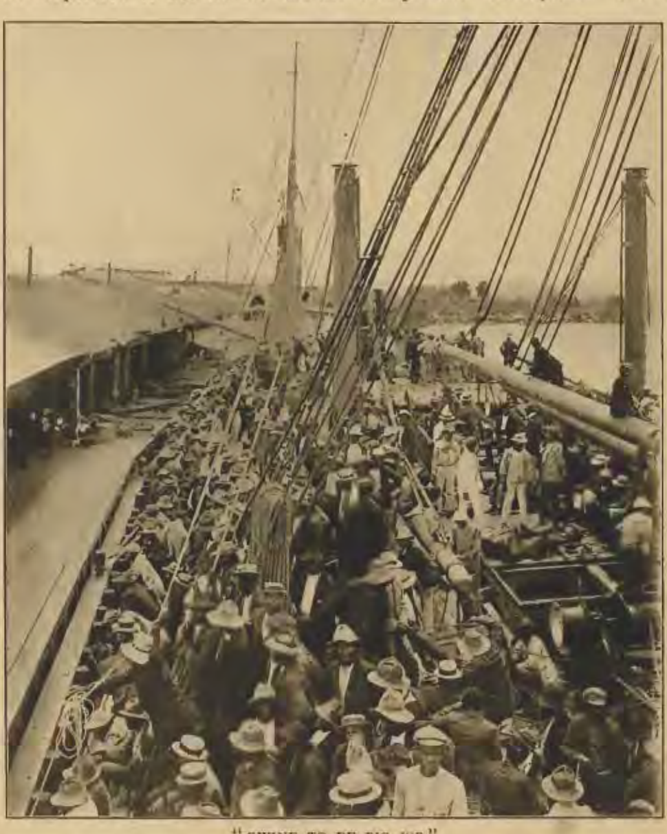
"GWINE TO DE BIG JOB"

the passenger quarters are to windward of them. The religious sentiment is strong upon them and as the sun goes down in the waste of waters the wail of hymn tunes sung to the accompaniment of a fiddle and divers mouth organs rises over the whistle of the wind and the rumble of the machinery. One can but reflect that ten years ago, before the coming of Col. Gorgas and his sanitation system, three out of five of these happy, cheerful blacks would never return alive from the Canal Zone. Today they invite no more risk than a business man in Chicago going to his office, and when their service is ended the United States government is obligated to return them to Jamaica where for a time their money will make them the idols of the markets, lanes