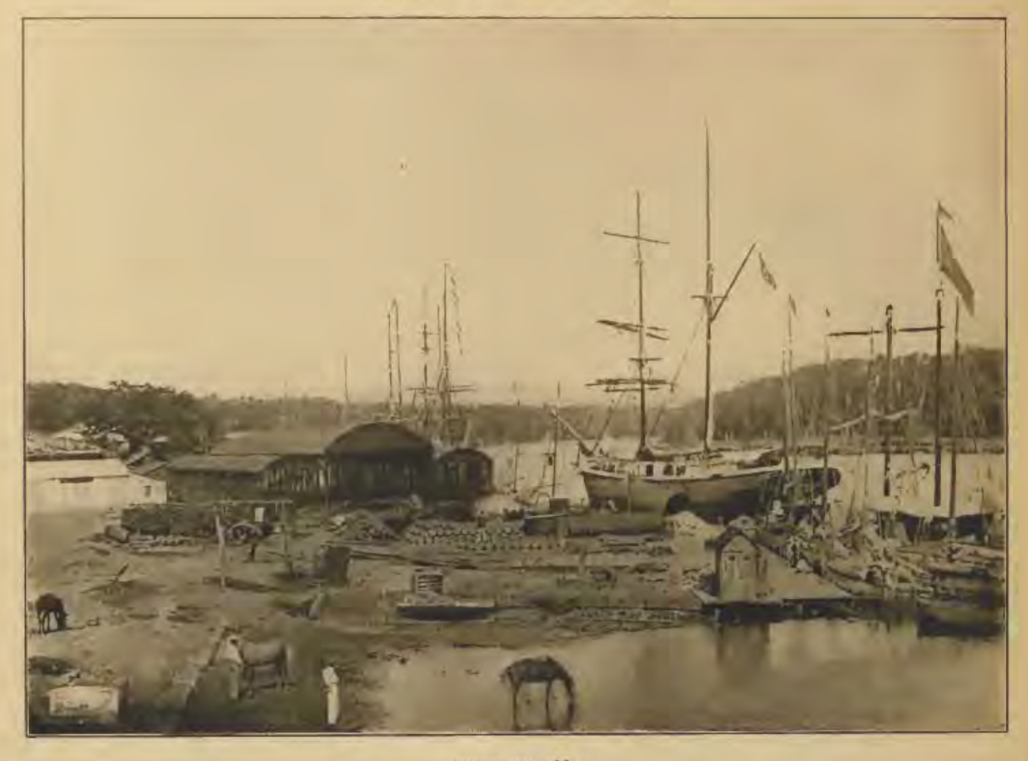
COLON IN 1884 The author counted twelve ocean liners one day at the docks now standing at this spot

construction which along the seafront stand out over the water on stilts. No building of any distinction meets the eye, unless it be the new Washington Hotel, a good bit of Moorish architecture, owned and conducted by the Panama Railroad which in turn is owned by the United States. The activities of Uncle Sam as a hotel keeper on the Isthmus will be worth further attention.