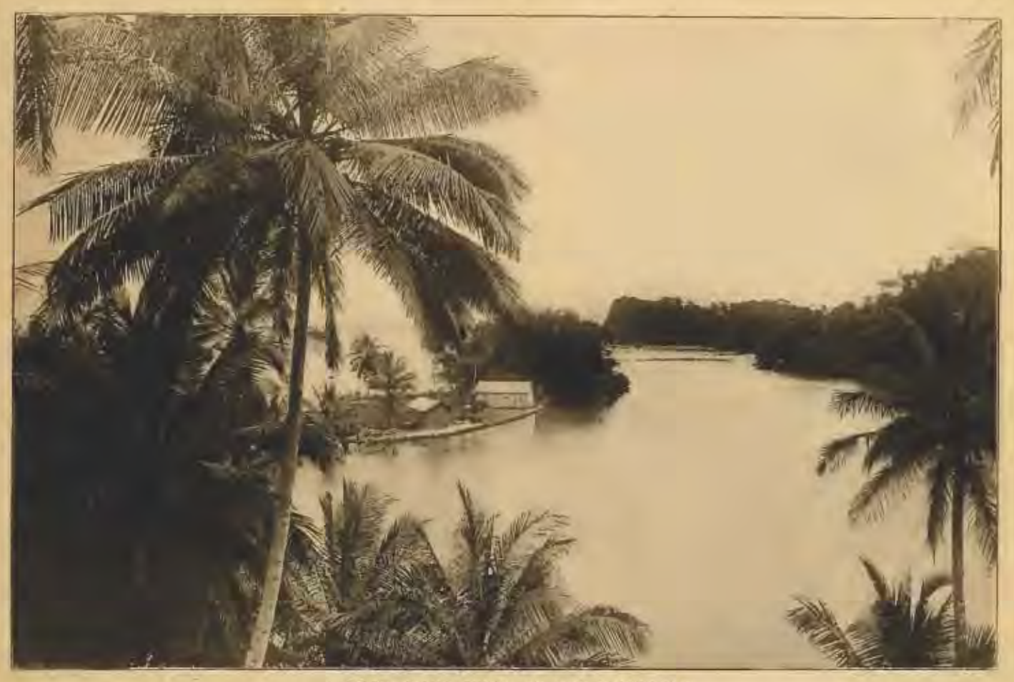
A PICTURESQUE INLET OF THE CARIBBEAN

thirds were again up and able to work. Then the exaggerated American moral sense, which is so apt to ignore the customs of other lands and peoples, caused the opium supply to be shut off. Perhaps the fact that the cost of opium daily per Chinaman was 15 cents had something to do with it. At any rate the whole body of Chinamen were soon sick unto death and quite ready for it. They made no effort to cling to the lives that had become hateful. Suicides were a daily occurrence and in all forms. Some with Chinese stolidity would sit upon a rock on the ocean's bed and wait for the tide to submerge them. Many used their own queues as ropes and hanged themselves. Others persuaded or bribed their fellows to shoot them dead. Some thrust sharpened sticks through their throats, or clutching great stones leaped into the river maintaining their hold until death made the grasp still more rigid. Some starved themselves and others died of mere brooding over their dismal state. In a few weeks but 200 were left alive, and these were sent to