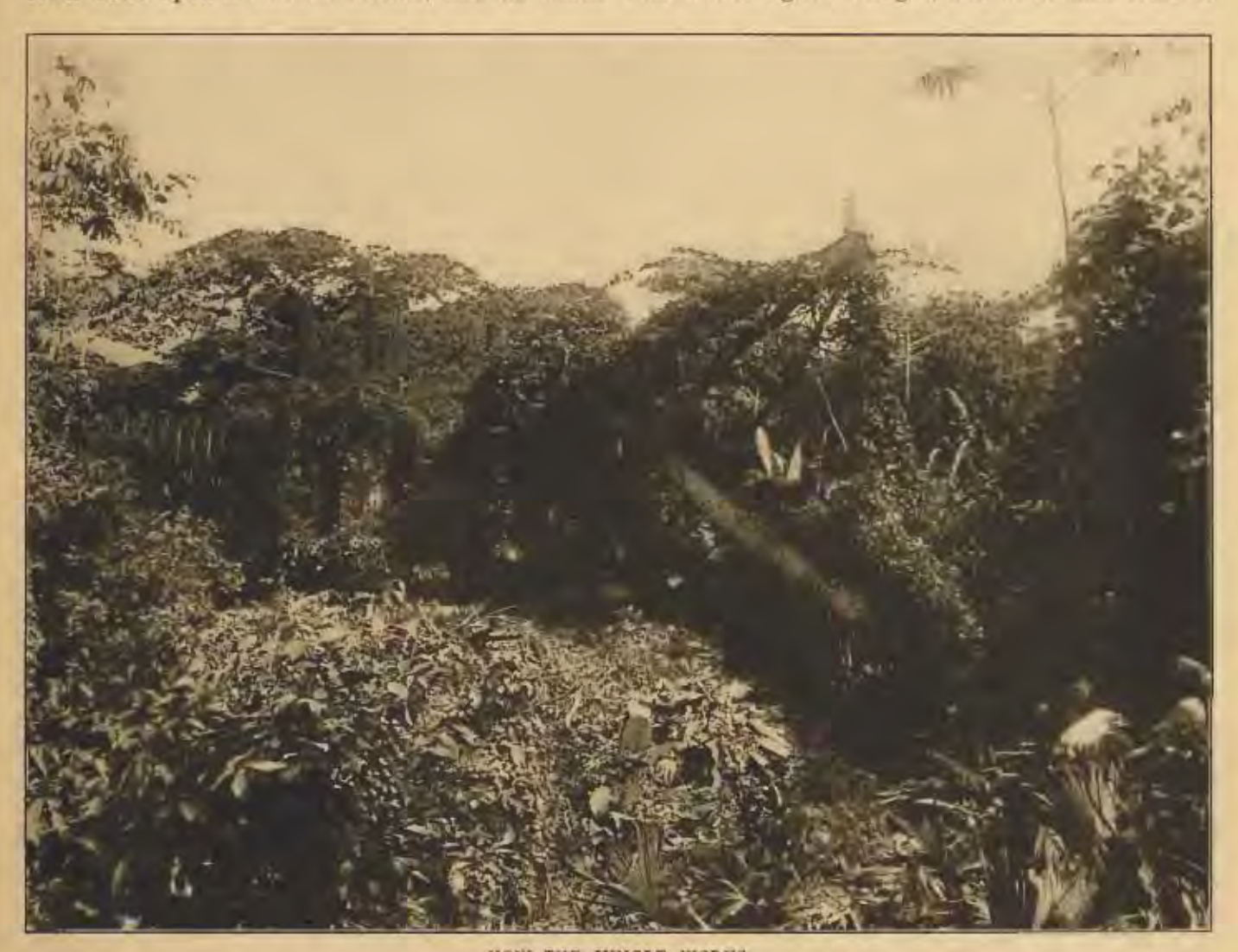
HOW THE JUNGLE WORKS Silently but persistently the advance of nature enshrouds man's work in living green

reaching a floating board benevolently provided by some merchant who hoped to thus bring custom to his doors. Along the water front between the steamship piers and the railroad there was an effort to pave somewhat as there was heavy freight to be handled, but even there the pavement would sink out of sight overnight, and at no time could it