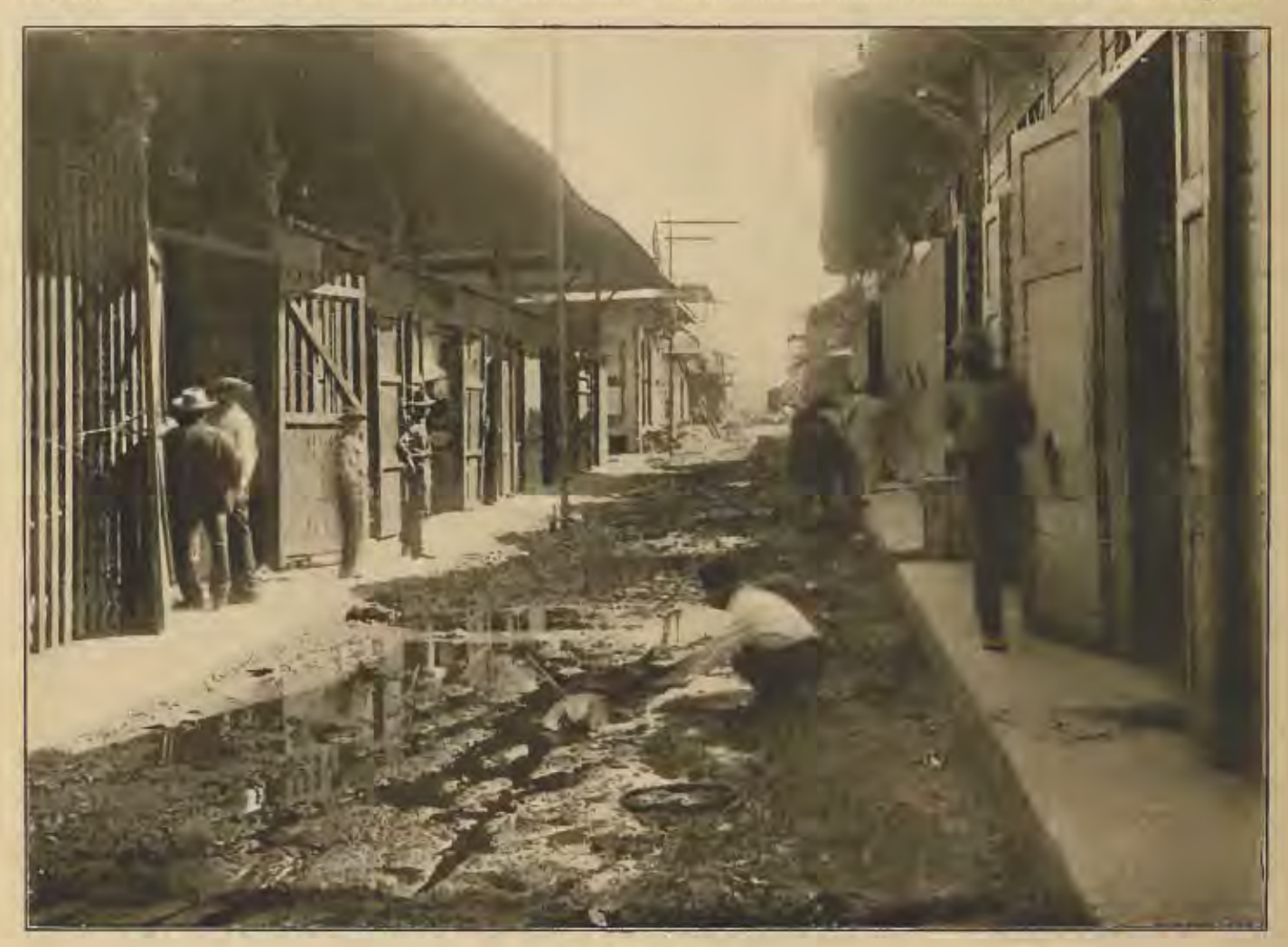
"BOTTLE ALLEY" A typical Colon street before the Sanitary Department concluded the work of cleaning up

About the base of the Toro light cluster the houses of the engineers employed on the harbor work, and on the fortifications which are to guard