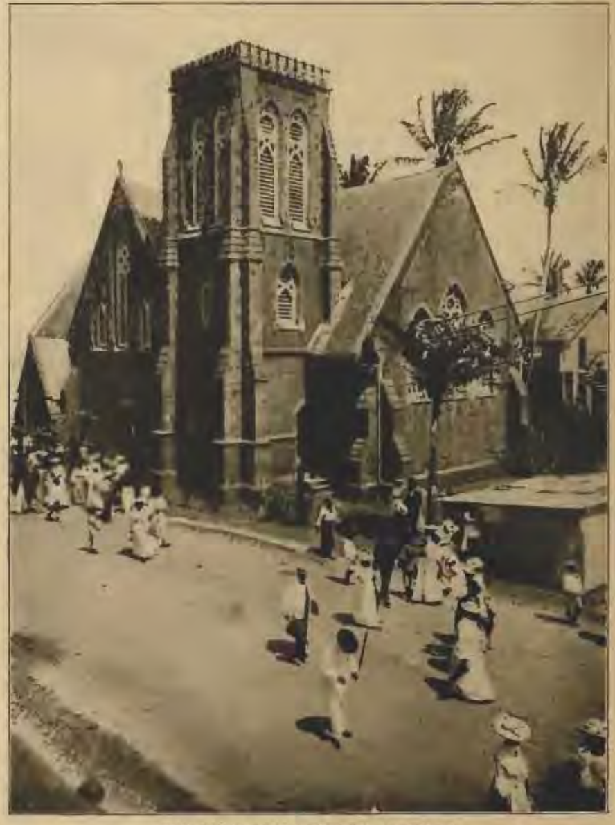
better harbors. San Lorenzo, whose The ritual is of the Church of England; the congregation almost wholly Jamaica negroes

Manzanilla Island, on which the greater part of Colon now stands, was originally a coral reef, on which tropical vegetation had taken root, and died down to furnish soil for a new jungle until by the repe-