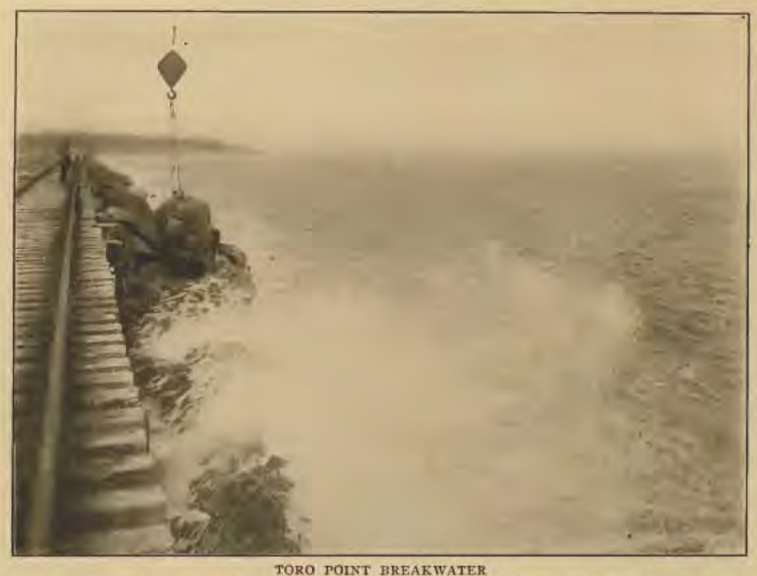
Before its construction northers often made the harbor of Colon untenable for ships

within its borders. Thus for some time a good No? Is it not so? Vell dere are two towns. My democrat was kept out of a job -it was the period port is Colon. Cristobal comes first. I pass it.