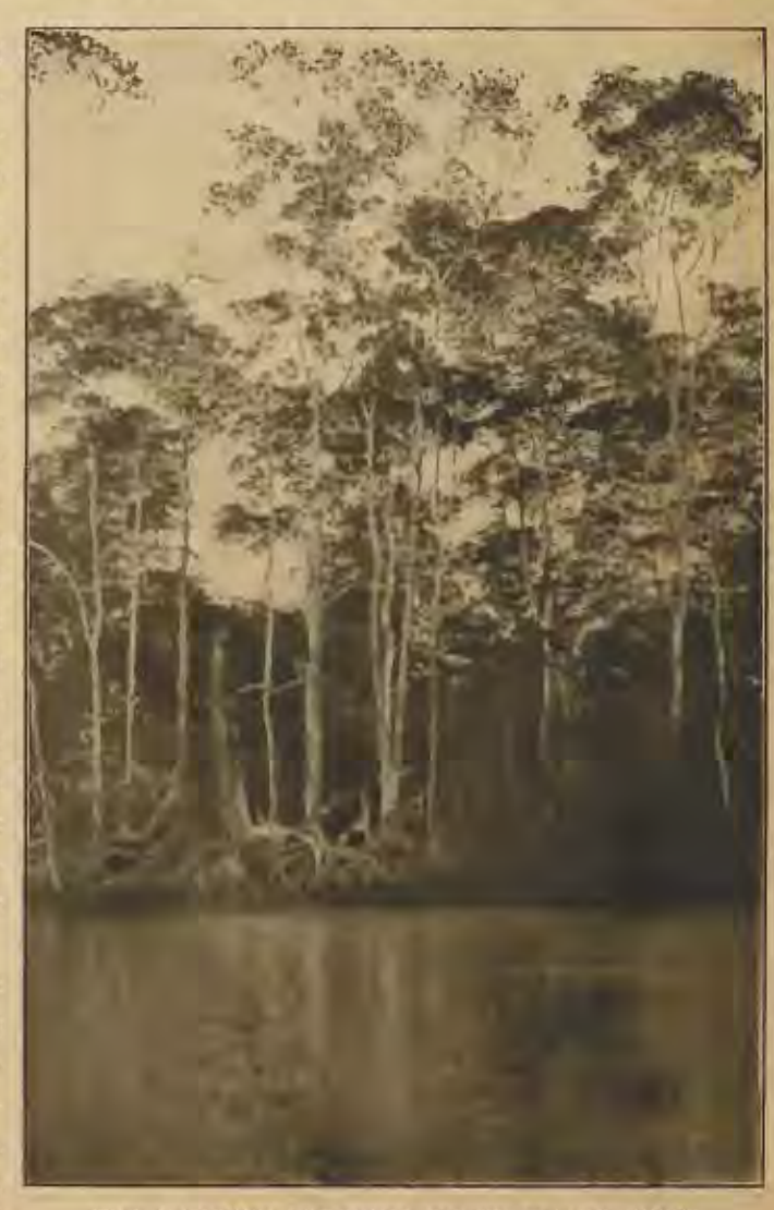
THE MANGOES MARCHING ON STILT-LIKE ROOTS

every nationality were experimented with but none were immune. The historian of the railroad reported that the African resisted longest, next the coolie, then the European, and last the Chinese. The experience of the company with the last named class of labor was tragic in the extreme. Eight hundred were landed on the Isthmus after a voyage on which sixteen had died. Thirty-two fell ill almost at the moment of landing and in less than a week eighty more were prostrated. Strangers in a strange land, unable to express their complaints or make clear their symptoms, they were almost as much the victims of homesickness as of any other ill. The interpreters who accompanied them declared that much of their illness was due to their deprivation of their accustomed opium, and for a time the authorities supplied them, with the result that nearly two-