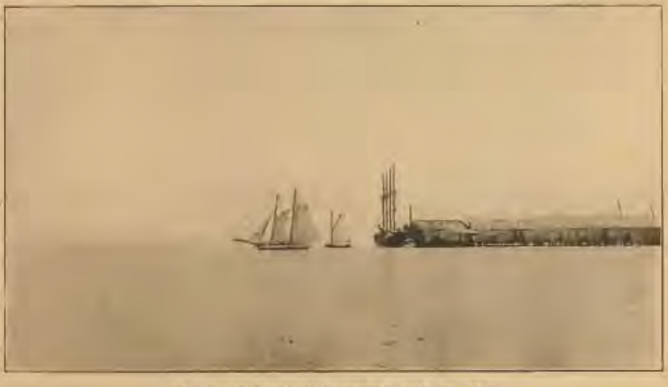
SAN BLAS LUGGER PUTTING OUT TO SEA

At Cristobal you are gravely taken to see the De Lesseps Palace, a huge frame house with two