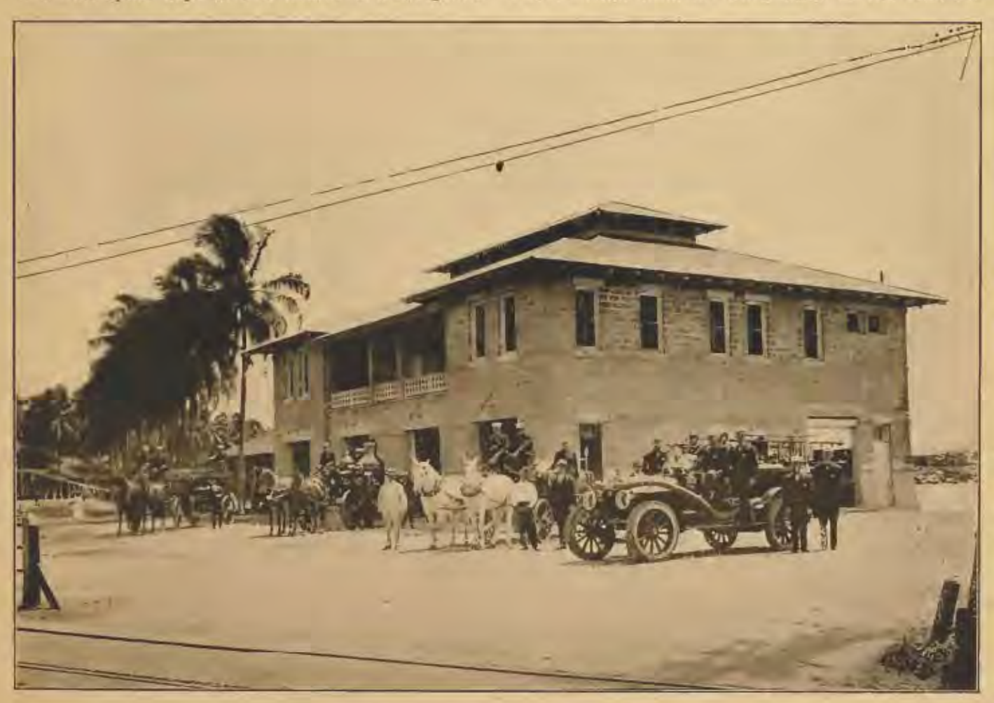
FIRE-PIGHTING FORCE AT CRISTOBAL

Most of the people in Colon live over their stores and other places of business, though back from the business section are a few comfortable looking residences, and I noticed others being built on made land, as though the beginnings of a mild "boom" were apparent. The newer houses are of concrete, as is the municipal building and chief public school. The Panama Railroad owns most of the land on