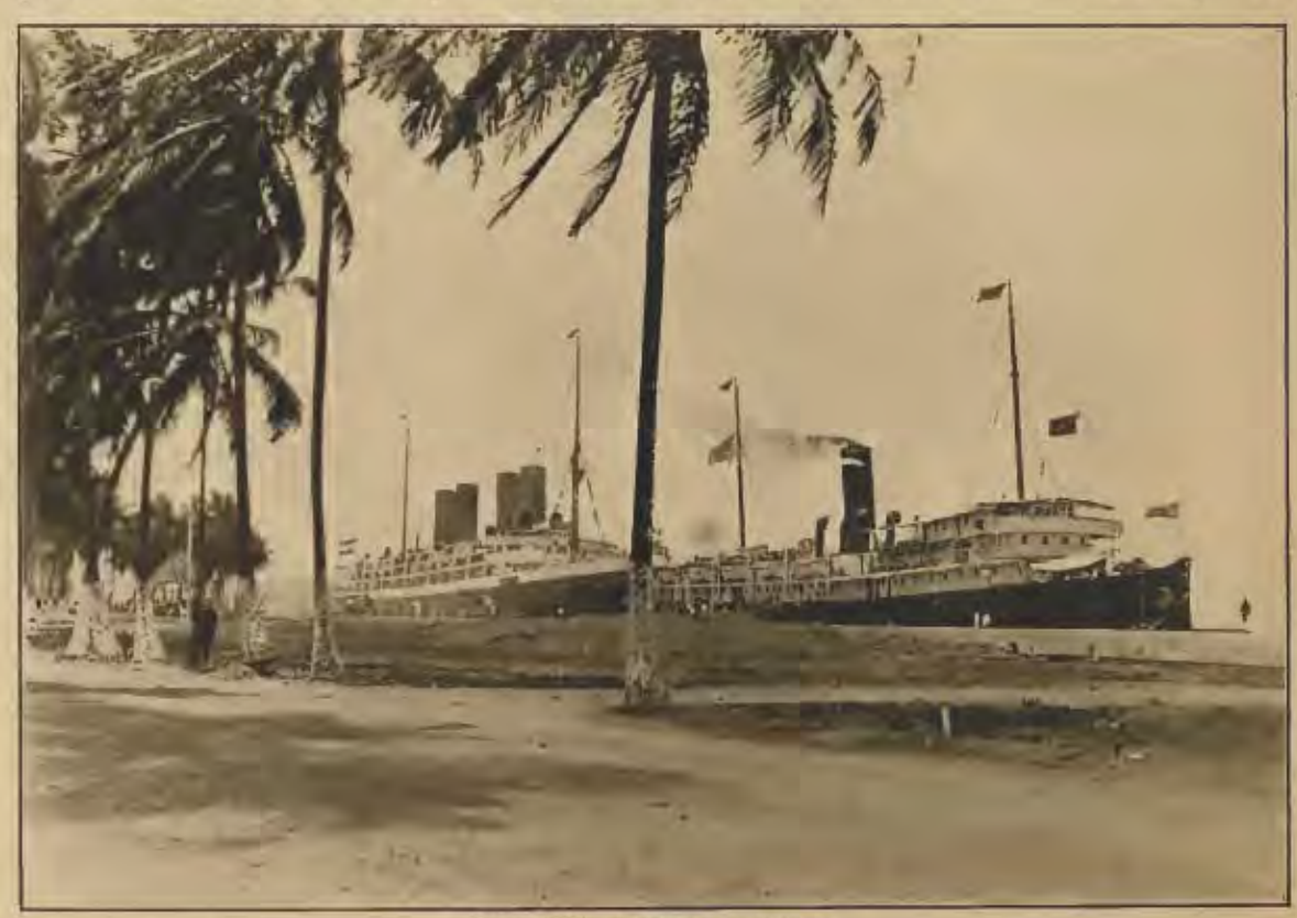
THE NEW CRISTOBAL DOCKS

of democratic ascendancy. Perhaps it was pressure for this job that led our government to yield. When the French began digging the canal they chose Limon Bay, the inlet on which Colon stands, as its Atlantic terminus and established a town of their own which they called Cristobal, being the French