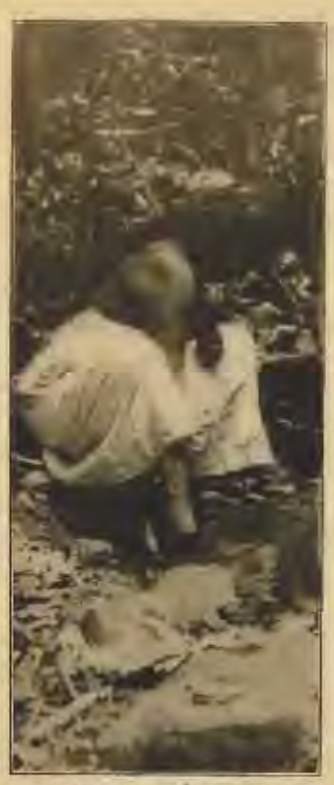
BY A COCLÉ BROOK

insects whose sting, as we learned half a century later, carried the germs of malaria and yellow fever -this was a new draft upon engineering skill and endurance that might well stagger the best. The demand was met. The road was built, but at a heavy cost of life. It used to be said that a life was the price of every tie laid, but this was a picturesque exaggeration. About 6000 men in all died during the construction period.