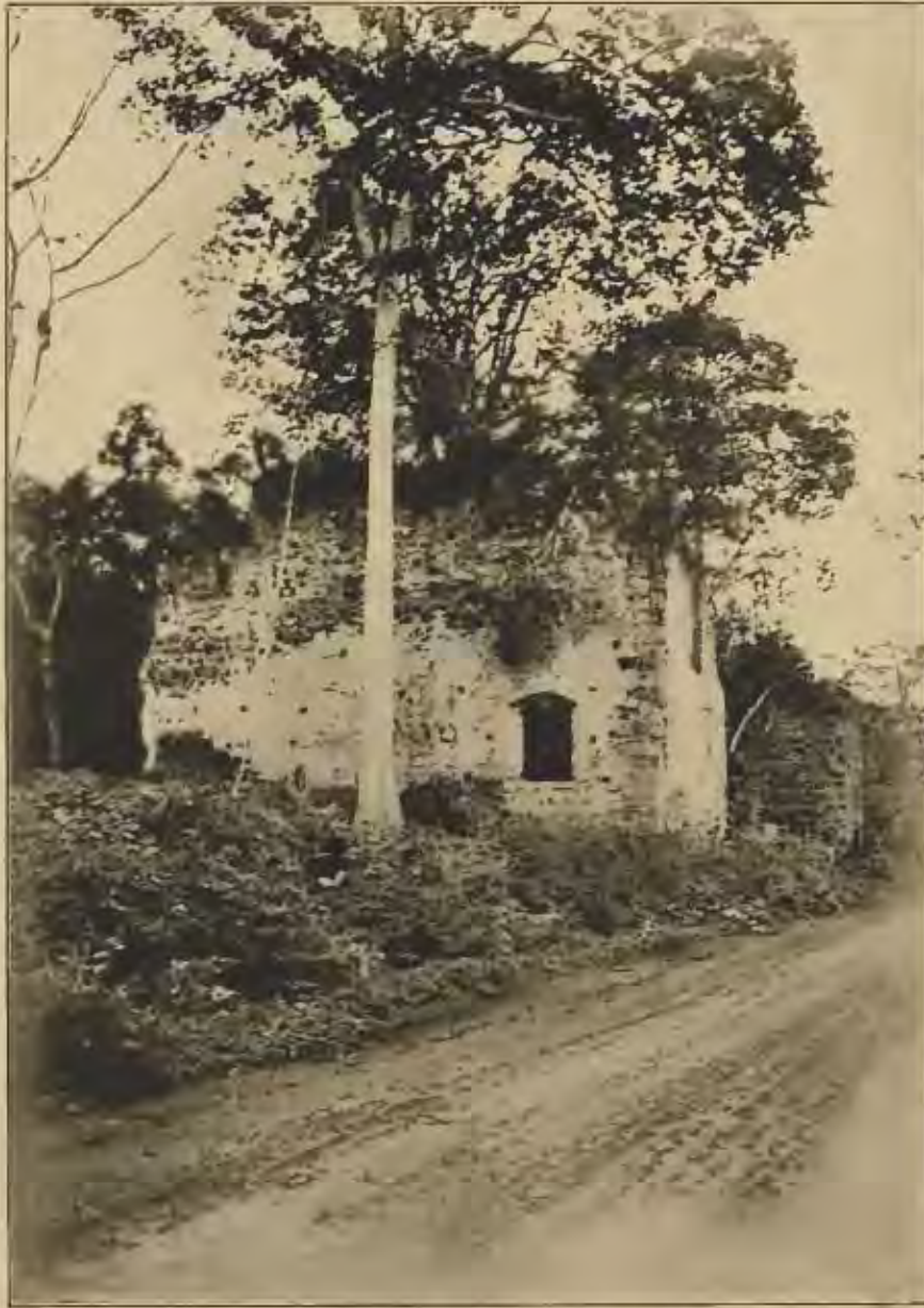
CASA REALE OR KING'S HOUSE

The country round about Panama was then, and still is, arable and well-fitted for grazing. The rural population was but small, more meager indeed than one would think would have been necessary for raising vegetables for so considerable a town.