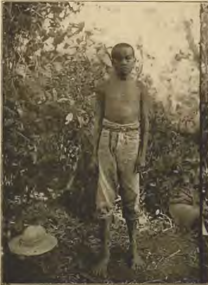
OUR GUIDE AT SAN LORENZO

the river from the ruins we have come to see and the uninitiated among us wonder why. It appears however that the descendants of the natives who so readily surrendered dominion of the land to the Spaniards are made of sterner stuff than their ancestors. Or perhaps it was because we had neither swords or breastplates that they reversed the 16th century practice and extorted tribute of silver from us for ferrying us across the stream in cayucas when our own boats and boat-men would have given us a greater sense of security. Landed in the village we were convoyed with great ceremony to the alcalde's hut where it was demanded that we register our names and places of residence. Perhaps that gave us a vote in the Republic of Panama, but we saw no political evidences about unless a small saloon, in a hut thatched with palmetto leaves and with a mud floor and basket work sides might be taken for a "headquarters". Indeed the saloon and a frame church were about the only signs of civilization about the town if we except a bill posted in the alcalde's