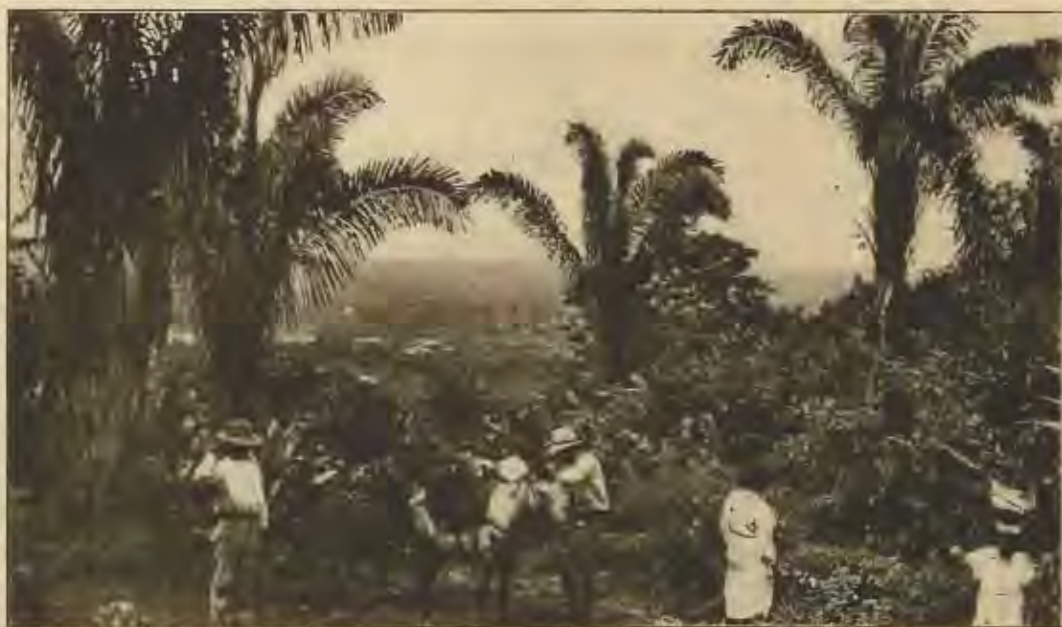
COUNTRY BACK OF PORTO BELLO

were of 40 pounds weight each and therefore hard to move, so Drake sought the King's Treasure House where he hoped to find more movable wealth. As the door was being broken down he fainted from loss of blood, and as he lay speechless on the sill the Spaniards rallied and attacked the invaders. Though Drake reviving sought to hold his men up to the fight, they had lost their dash, and despite his protestations carried him bodily to the boats. The men were wiser than their leader because it was the chance arrival of some soldiers from Panama that had rallied the populace of the town, and the English, deprived of Drake's leadership, would certainly have been overwhelmed. That leader however grieved sincerely when a Spanish spy told him later that there was 360 tons of silver in the town and many chests of gold in the Treasure House.