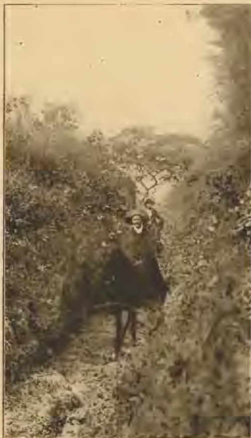
A TRAIL NEAR PORTO BELLO

For fifteen days the buccaneers held high carnival in Porto Bello. Drunk most of the time, weakened with debauchery and riot, with discipline thrown to the winds, and captains and fighting men scattered all over the town in pursuit of women and wine, the outlaws were at the mercy of any determined assailant. Esquemeling said, "If there could