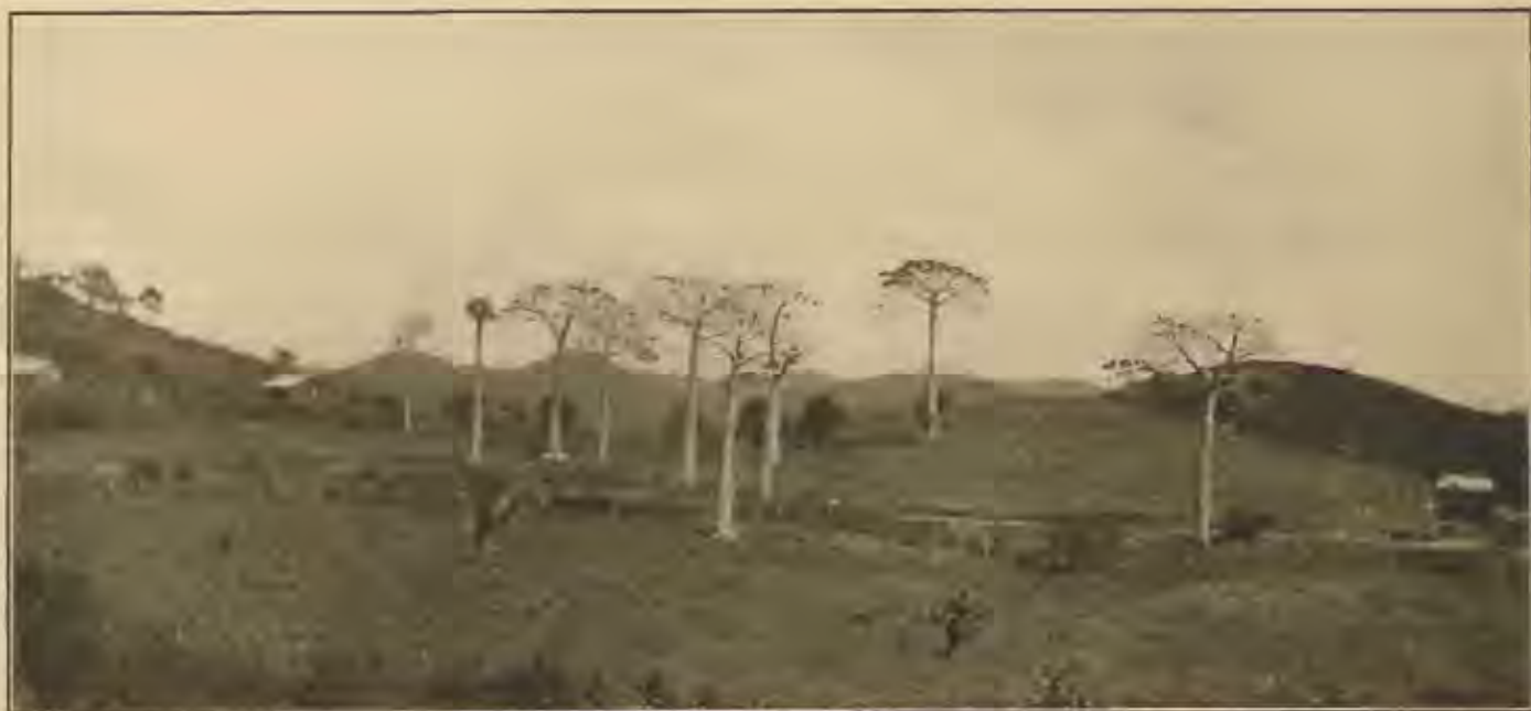
A GROUP OF CUEPA TREES

willing to help them with gold as with powder and lead. In some miraculous way they raised it, and Morgan and his men departed, making their way to that town of revelry, Port Royal, of which I have already spoken, at the entrance to Kingston harbor. Perhaps it is fair to contrast with Esquemeling's story of the exploit Morgan's official report—for this worthy had a royal commission for his deeds. The Captain reported that he had left Porto Bello in as good condition as he found it, that its people had been well treated, so much so that "several ladies of great quality and other prisoners who were offered their liberty to go to the President's camp refused, saying they were now prisoners to a person of quality who was more tender of their honors than they doubted to find in the President's camp; and so voluntarily continued with him."