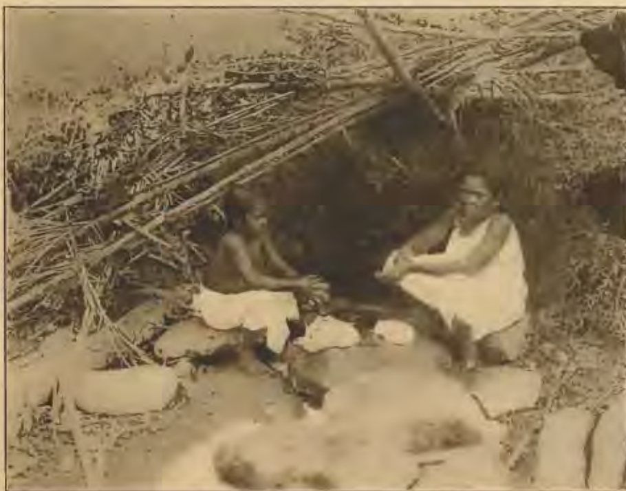
A CHOLO MOTHER AND DAUGHTER

torture to compel him to confess where he had hidden it. When all had been extorted that seemed possible the buccaneers made ready to depart. But first Morgan demanded 100,000 pieces of eight, in default of which he would burn the city and blow up the castles. The wretched citizens sought aid of the President of Panama who was as un-