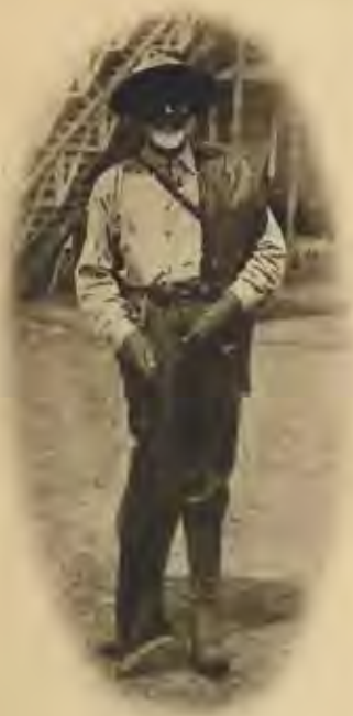
A CHARACTER OF COLON

enterprise. Being a gentleman of spirit and a true sport, Admiral Vernon, on approaching the Isthmus, sent one of his ships into other waters, "disdaining to appear before Porto Bello with one ship more than he had engaged to take it with." Success came to him with ease. Only four of his ships were engaged and the only considerable loss was among a landing party which stormed the lower battery of the Iron Fort. The Spaniards showed but little stomach for the fight, and it is worth noting that in the recurrent affrays in the West Indies and Central America the English whipped them with the same monotonous certainty with which the latter had beaten the Indians. Any one desiring to draw broad generalizations as to the comparative courage of nations is welcome to this fact.