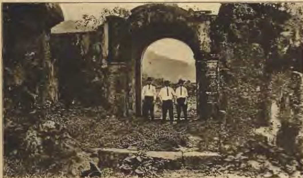
SPANISH RUINS, PORTO BELLO

will never dredge away, to open a ready water-way to the base of the Gatun locks. To the left covering a low point, level as if artificially graded, is a beautiful cocoanut grove, to the right, across a bay perhaps a quarter of a mile wide is a native village of about fifty huts with an iron roofed church in the center—beyond the village rises a steep hill densely covered with verdure, so that it is only by the keenest searching that you can pick out here a stone sentry tower, there the angle of a massive wall—the ruins of the Castle of San Lorenzo.