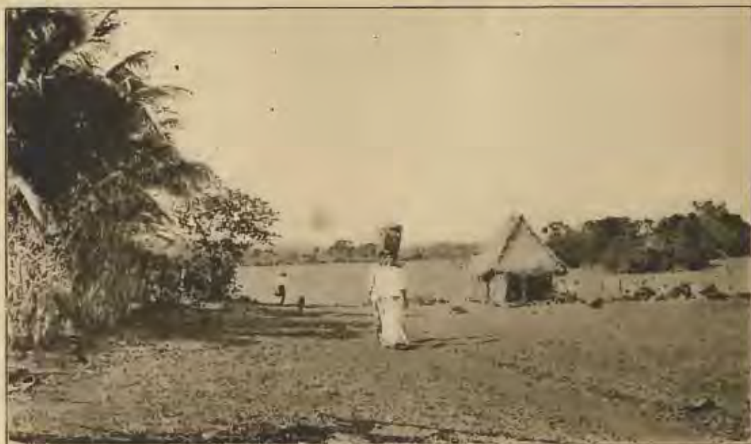
NATIVE WOMEN OF THE SAVANNAS BEARING BURDENS

had one beast of prey they feared and hated more than the lion or the boa—the Spaniard. Whether Indian or Cimmaroon—as the escaped slaves were called—every man out in that tropic wilderness had some good ground for hating the Spaniards, and so when Drake and his men came, professing themselves enemies of the Spaniards likewise, the country folk made no war upon them but aided them to creep down almost within sight of Panama. Halting here, at a point which must have been well within the