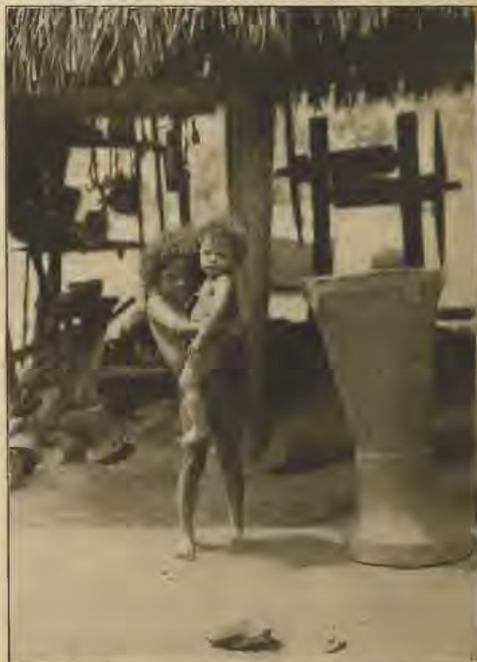
NATIVE CHILDREN, PANAMA PROVINCE

notwithstanding which the town was repeatedly taken by the English. Even today the ruins of town and forts are impressive, more so than any ruins readily accessible on the continent, though to see them at their best you must be there when the jungle has been newly cut away, else all is lost in a canopy of green. Across the bay from the town, about a mile and a half, stand still the remnants of the "Iron Castle" on a towering bluff, Castle Gloria and Fort Geronimo. These defensive works were built of stone, cut from reefs under the water found all along the coast. Almost as light as pumice stone and soft and easily worked when first cut, this stone hardens on exposure so that it will stop a ball without splitting or chipping. When Admiral Vernon, of the British navy, had captured the town in 1739, he tried to demolish the fort and found trouble enough. "The walls of the lower battery," he recorded, "consisting of 22 guns, were nine foot thick and of a hard stone cemented with such fine