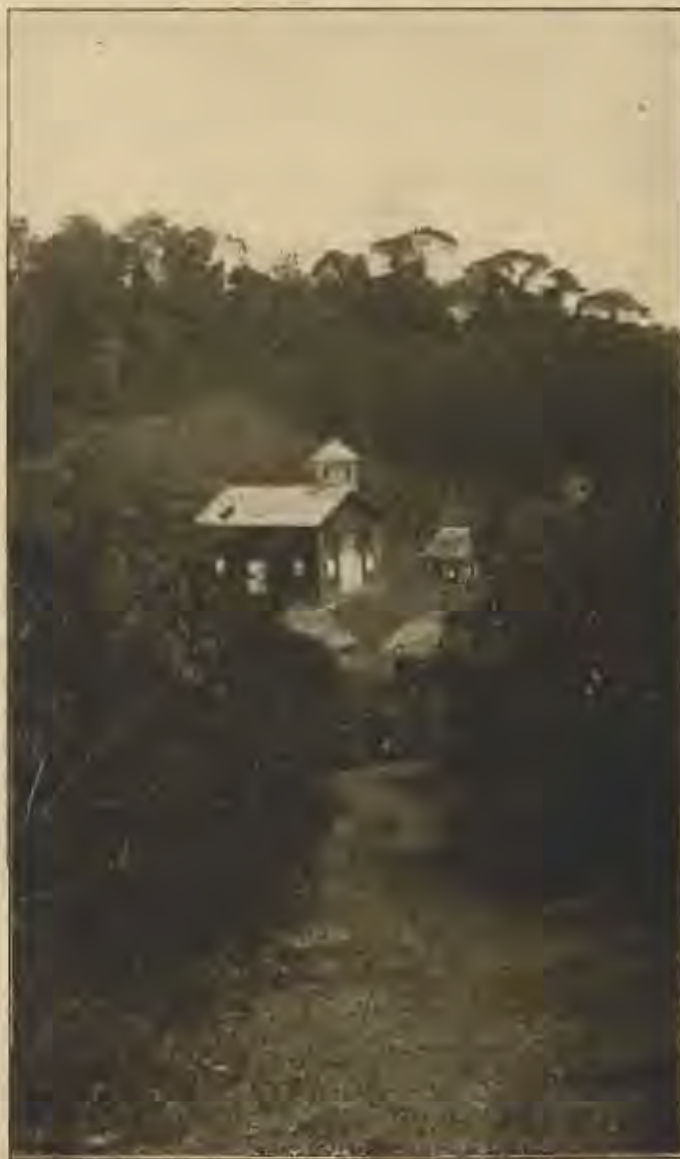
CHURCH AT CHAGRES

The native Indian knows it and avoids it by doing