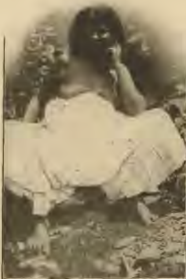
A LADY OF THE SAVANNA