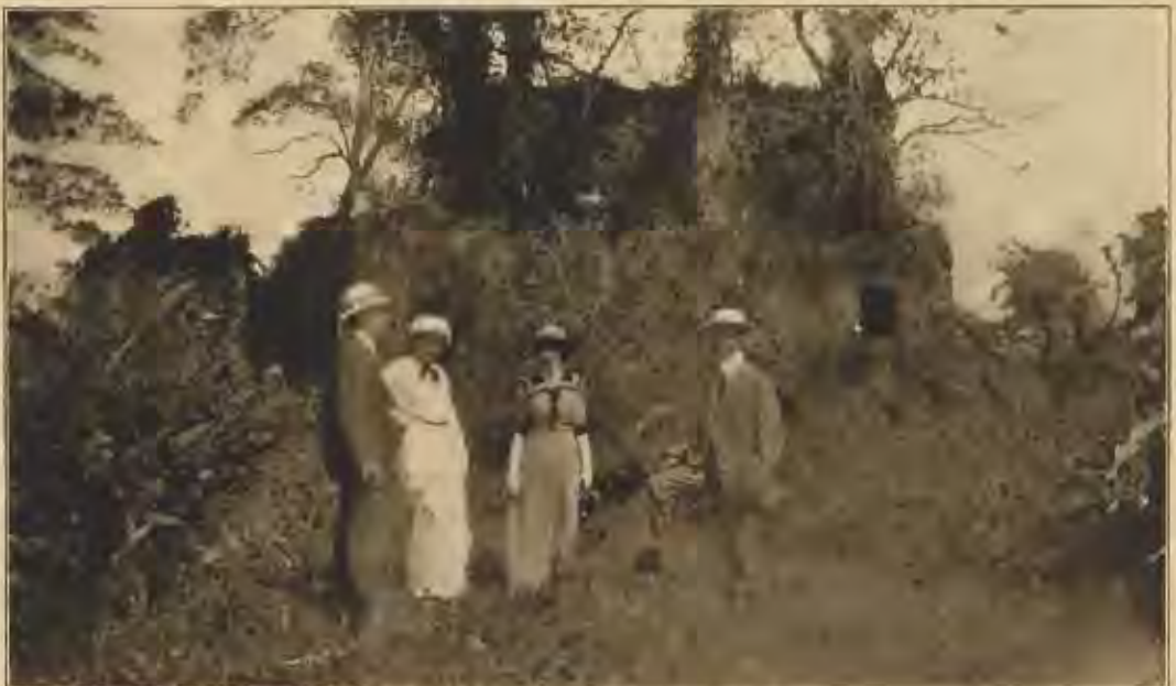
NEAR A CONVENT AT OLD PANAMA

"There belonged to this city (which is also the head of a bishopric) eight monasteries, whereof seven were for men and one for women; two stately churches and one hospital. The churches and monasteries were all richly adorned with altar-pieces and paintings, huge quantity of gold and silver, with other precious things. . . . Besides which ornaments, here were to be seen two thousand houses of magnificent and prodigious building, being all of the greatest part inhabited by merchants of that country, who are vastly rich. For the rest of the inhabitants of lesser quality and tradesmen, this city contained five thousand houses more. Here were also great numbers of stables, which served for the horses and mules, that carry all the plate, belonging as well unto the King of Spain as to private men, towards the coast of the North Sea. The neighboring fields belonging to this city are all cultivated and fertile plantations, and pleasant gardens, which afford delicious prospects unto the inhabitants the whole year long."