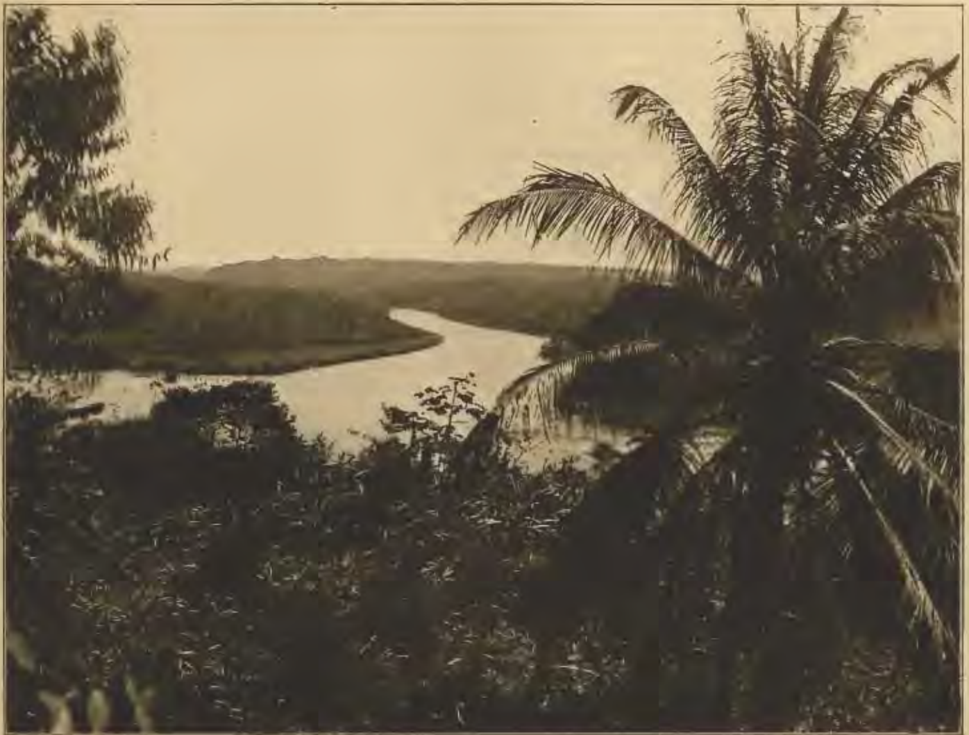
LOOKING UP THE CHAGRES FROM SAN LORENZO

The villagers every now and then cut away the dense underbrush which grows in the ancient fosse and traverses and conceals effectually the general plan of the fortress from the visitor. This cleaning up process unveils to the eye the massive masonry, and the towering battlements as shown by some of the illustrations here printed. But, except to the scientific student of archæology and of fortification, the ruins are more picturesque as they were when I saw them, overgrown with creeping vines and shrubs jutting out from every cornice and crevice, with the walls so masked by the green curtain that when some sharp salient angle boldly juts out before you, you start as you would if rounding the corner of the Flatiron Building you should come upon a cocoanut palm bending in the breeze. Here you come to great vaulted chambers, dungeons lighted