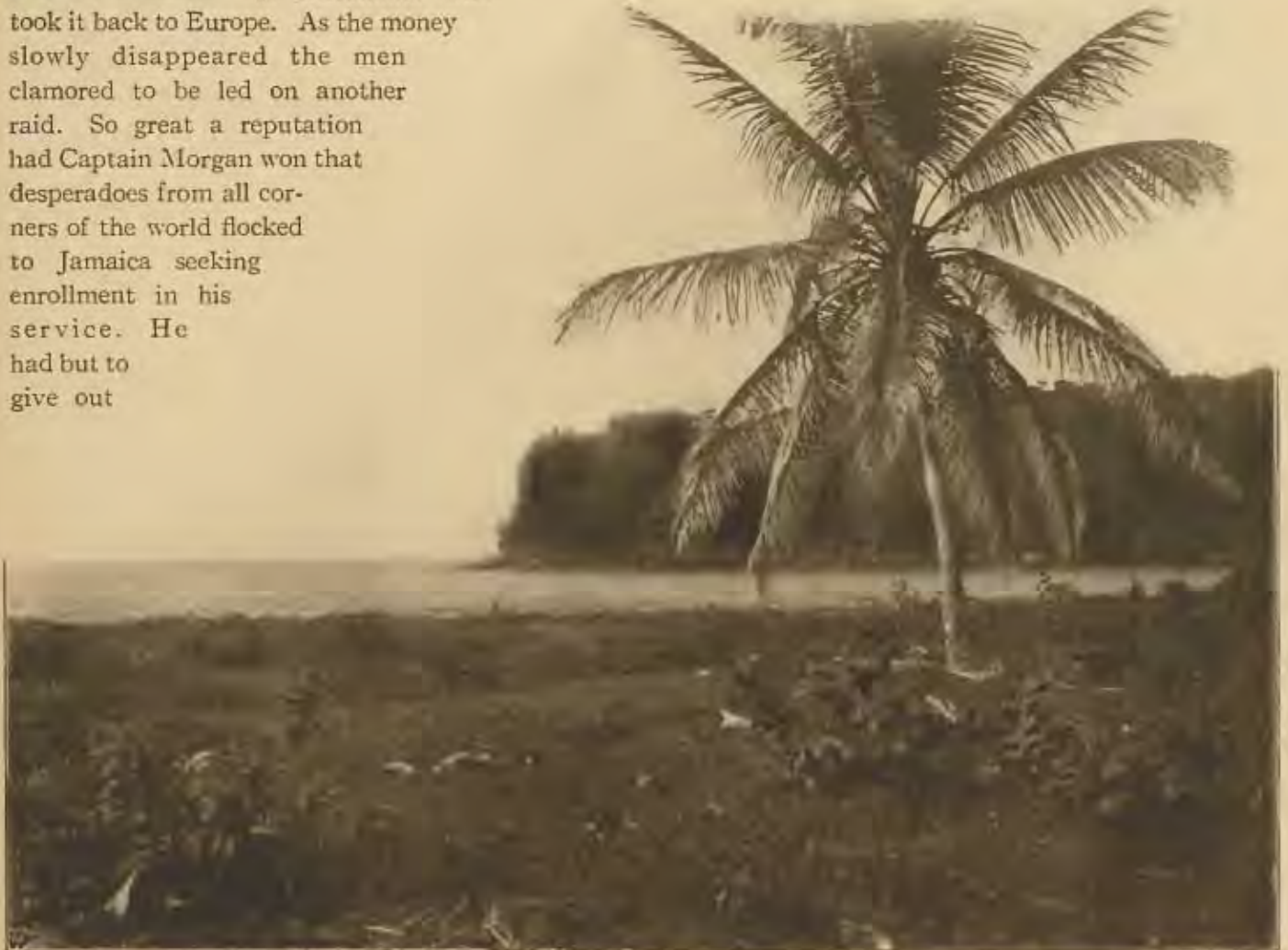
MOUTH OF THE CHAGRES RIVER

Designating the south side of the island of Tortuga as a rendezvous, he wrote certain gentry whom Esquemeling in a matter of fact way calls "the ancient and expert Pirates there abiding", asking their coöperation. By the 24th of October, 1670, he had gathered together 37 ships fully armed