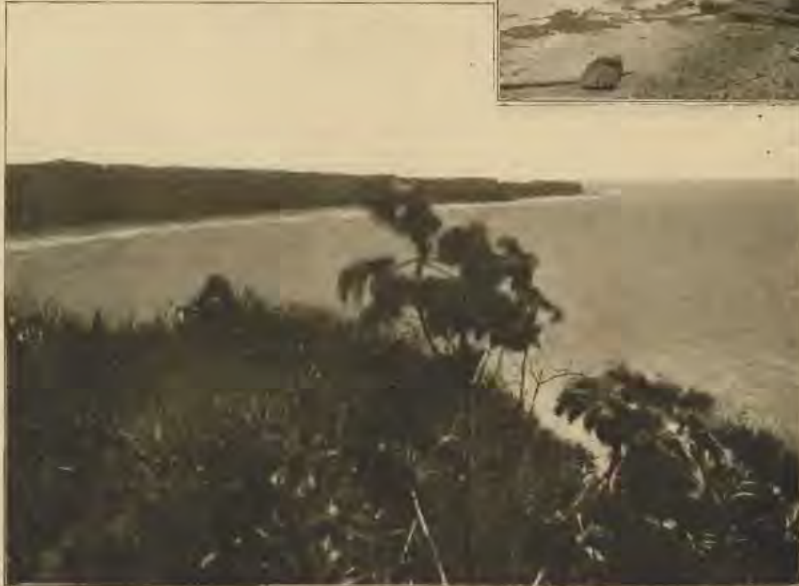
MOUTH OF THE CHAGRES FROM THE FORT

The upper picture shows the sea beach on the Pacific Coast littered with drift-wood