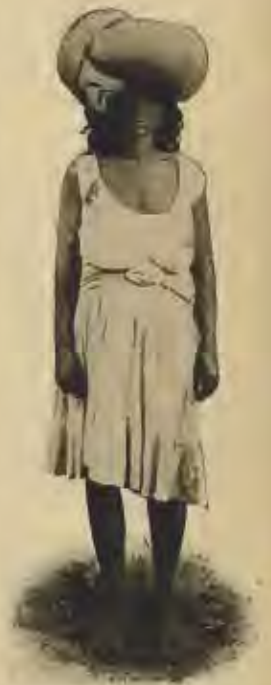
NATIVE PANAMA WOMAN

Morgan and his ravenous raid to consider the later history of the two strongholds—Porto Bello and San Lorenzo—which lie to the east and west of Colon. It was not the rude shock of war which reduced them to the state of desolation and ruin in which visitors now find them—though of such shocks they certainly experienced enough. Morgan on his return from Panama blew up San Lorenzo and left it a wreck, but the Spaniards rebuilt it stronger than ever and