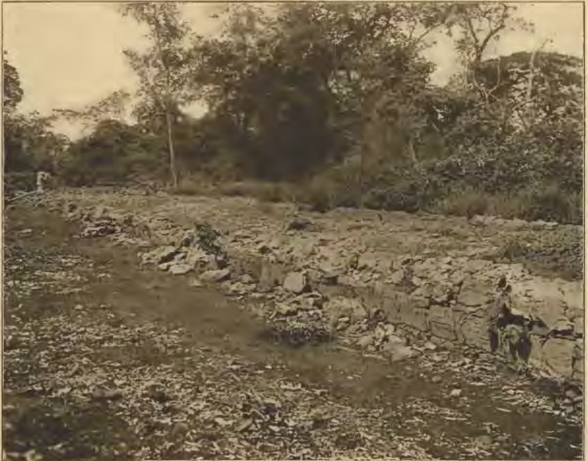
CAMINA REALE, OR ROYAL ROAD NEAR PORTO BELLO

muleteer turned his animal and fled, crying to the saints to protect him from the sheeted specter in the path. The captain in charge of the caravan was dubious about ghosts, but, there being a number of mules loaded with grain at hand, concluded to send them on to see if there were anything about the ghosts which a proper prayer to the saint of the day would exorcise. So the Englishmen again