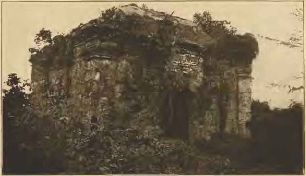
OLD SPANISH MAGAZINE

most of his traveling by canoe. On our trip to the river's mouth we passed many in their slender cayucas, some tied by a vine to the bank patiently fishing, others on their way to or from market with craft well loaded with bananas on the way up, but light coming back, holding gay converse with each other across the dark and sullen stream. Here and there through breaks in the foliage we see a native house, or a cluster of huts, not many however, for the jungle is too thick and the land too low here for the Indians who prefer the bluffs and occasional broad savannas of the upper waters. As we approach its outlet the river, about fifty or sixty yards wide thus far, broadens into a considerable estuary, and rounding a point we see before us the blue Pacific breaking in white foam on a bar which effectually closes the river to all save the smallest boats, and which you may be sure the United States