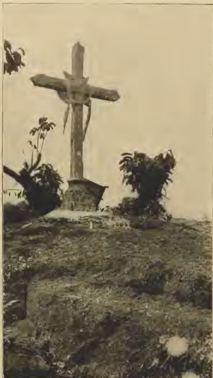
WAYSIDE SHRINE ON THE SAVANNA ROAD

and were so hungry that if they had slain a few Spaniards they would quite probably have cooked and eaten them. For six days they struggled with the jungle without finding any food whatsoever, then they discovered a granary stored with maize which they ate exultingly. Leather scraps became a much prized article of food, just as in a very different climate Greely's men in the Arctic circle kept alive on shreds cut from their sealskin boots. Of leather as an article of diet Esquemeling writes: