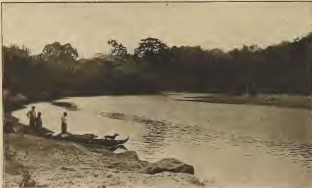
ON THE UPPER CHAGRES