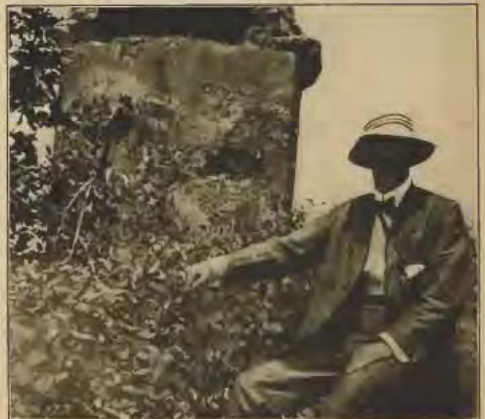
THE AUTHOR AT SAN LORENZO

"Not much fun carrying a steel helmet, a heavy leather jacket and a twenty-pound blunderbuss up this road on a hot day, with bullets and arrows whistling past," remarks a heavy man in the van, and the picture he conjures up of the Spanish assailants on that hot afternoon in 1780 seems very vivid. Although the fort, the remains of which are now standing, is not the one which Morgan destroyed, the site, the natural defenses and the plan of the works are identical. There was more wood in the original fort than in that of which the remains are now discernible—to which fact its capture was due.