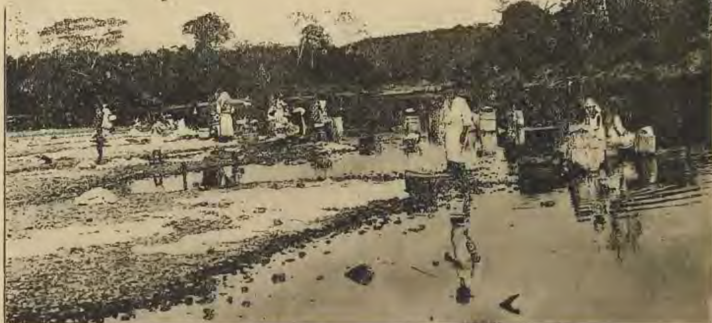
THE TRUE NATIVE SOCIAL CENTER

were forced to attack from the landward side, though as you were scaling that toilsome slope you wondered that any race of humans ever dared attack it at all.