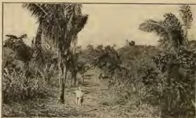
THE TRAIL NEAR CULEBRA

Prior to this time there had been several sporadic negotiations opened with different nations of Central America for canal rights. The most important one was a treaty signed at Bogotá in 1870 by an envoy especially authorized by President Grant. But this treaty was never ratified by our Senate, and was amended out of acceptable form by the Colombian Senate. For the purposes of this narrative we may well consider the diplomatic history of the canal to begin with the passage of the Spooner act in 1902. This act, written by Senator John C. Spooner of Wisconsin, authorized the Panama route if the French property could be bought for $40,000,000 and the necessary right of way secured from Colombia. Failing this the Commission of seven members created by the act was authorized to open negotiations with Nicaragua. Events made it quite apparent that the Nicaragua clause was inserted merely as a club to be used in the negotiations with Co-