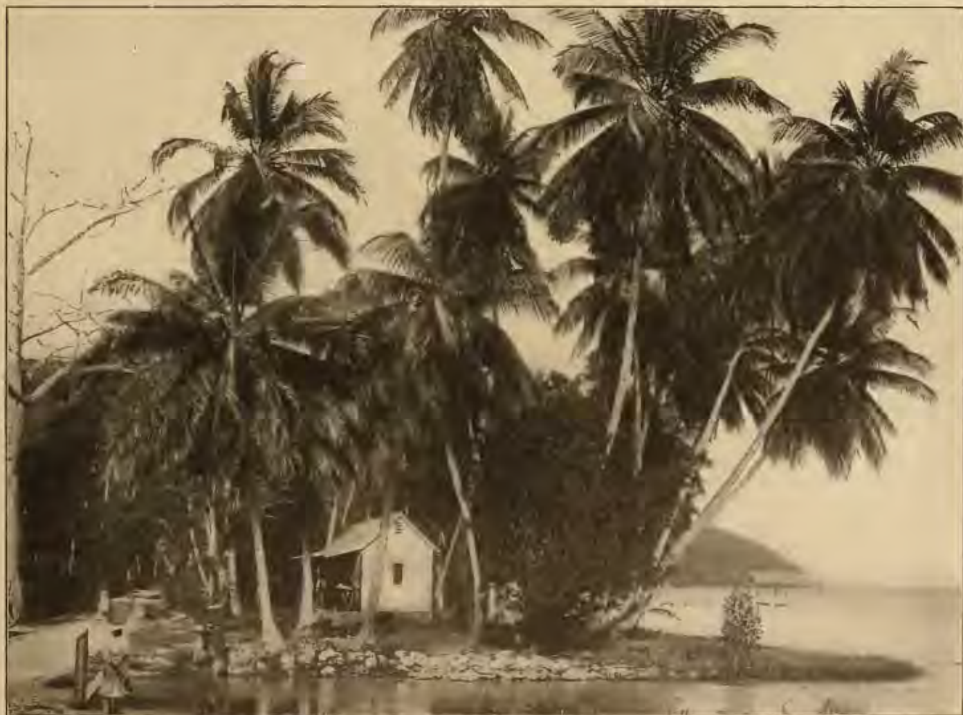
IN THE BANANA COUNTRY, ON THE COAST NEAR BOCAS DEL TORO

of Panama, wanted to see some American money spent in their various marts of trade. The French were rapidly disappearing. The business of all their commercial institutions from dry goods stores down to saloons was falling off. Even the lottery did not thrive as of yore and the proprietors of the lesser games of chance, that in those days were run quite openly, were reduced to the precarious business of robbing each other. All these and other vested interests called for immediate negotiation of any sort of a treaty which would open the spigots of Uncle Sam's kegs of cash over the two thirsty Isthmian towns. It was irksome too to think that the parent state of Colombia would make the treaty and handle the cash accruing under it. The Yankees were ready to pay $10,000,000 down, and it was believed a further rental of $250,000 for the right to build a canal every foot of which would be on