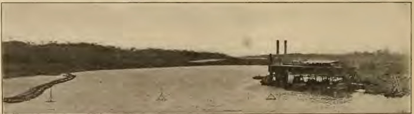
NEAR THE PACIFIC ENTRANCE TO THE CANAL

the engineering work done by the French. Those sturdy, alert Americans who are now putting the Big Job through will take pains to give their predecessors the fullest credit for work done, for dirt moved, for surveys made and for machinery designed—a great lot of it is in use on the line today, including machines left exposed in the jungle twenty years. Hundreds of their buildings are still in use. If, after listening to the honest and generous praise expressed by our engineers, the visitor will go out to the cemetery of Mount Hope, near Cristobal, and read the lines on the headstones of French boys who came out full of hope and ambition to be cut down at twenty-two, twenty-five—all