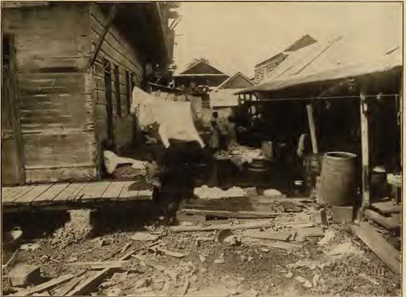
FILTH THAT WOULD DRIVE A BERKSHIRE FROM HIS STY

But under the conditions as they found them, the French could never have completed the canal. Only a government could be equal to that task. President Roosevelt found to his own satisfaction at least that neither private contract nor civilian management was adequate. Most emphatically, if the desire for profit was to be the sole animating force the canal could never be built at all. When the