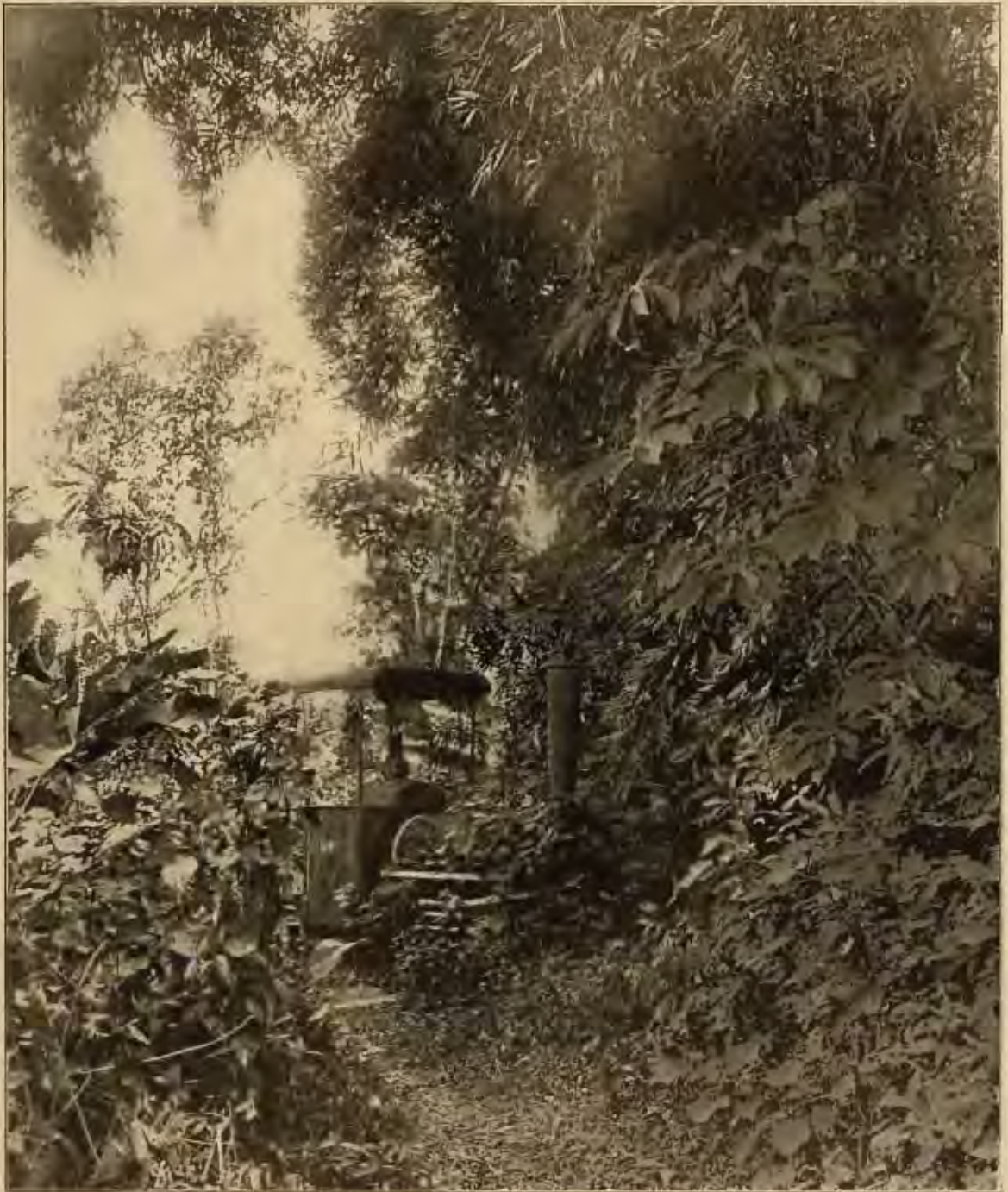
OVERWHELMED BY THE JUNGLE

a decision which the French themselves were forced to reverse and which the United States definitely abandoned early in its work. In the French Con-