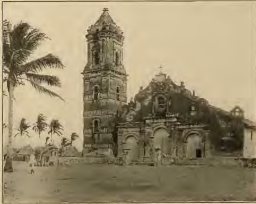
AN OLD SPANISH CHURCH

This edifice, still standing at Nata, is said to be the oldest church in Panama