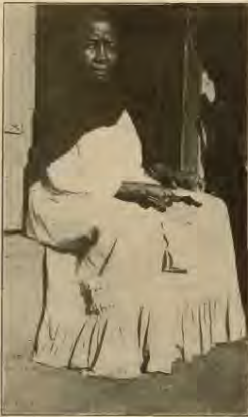
A LOTTERY TICKET SELLER

of canal the cut at Culebra is 495 feet below the crest of Gold Hill and 364 feet below the crest of Contractor's Hill opposite. The top width of this cut is over half a mile. To carry the canal to sea-level would mean a further cut of eighty-five feet with vastly enhanced liability of slides. As for the Chagres River, that tricky stream crosses the line of the old French canal twenty-three times. As the river is sometimes three or four feet deep one day and nearly fifty feet deep at the same point the next—a turbid, turbulent, roaring torrent, carrying trees, huts and boulders along with it—the canal could obviously not exist with the