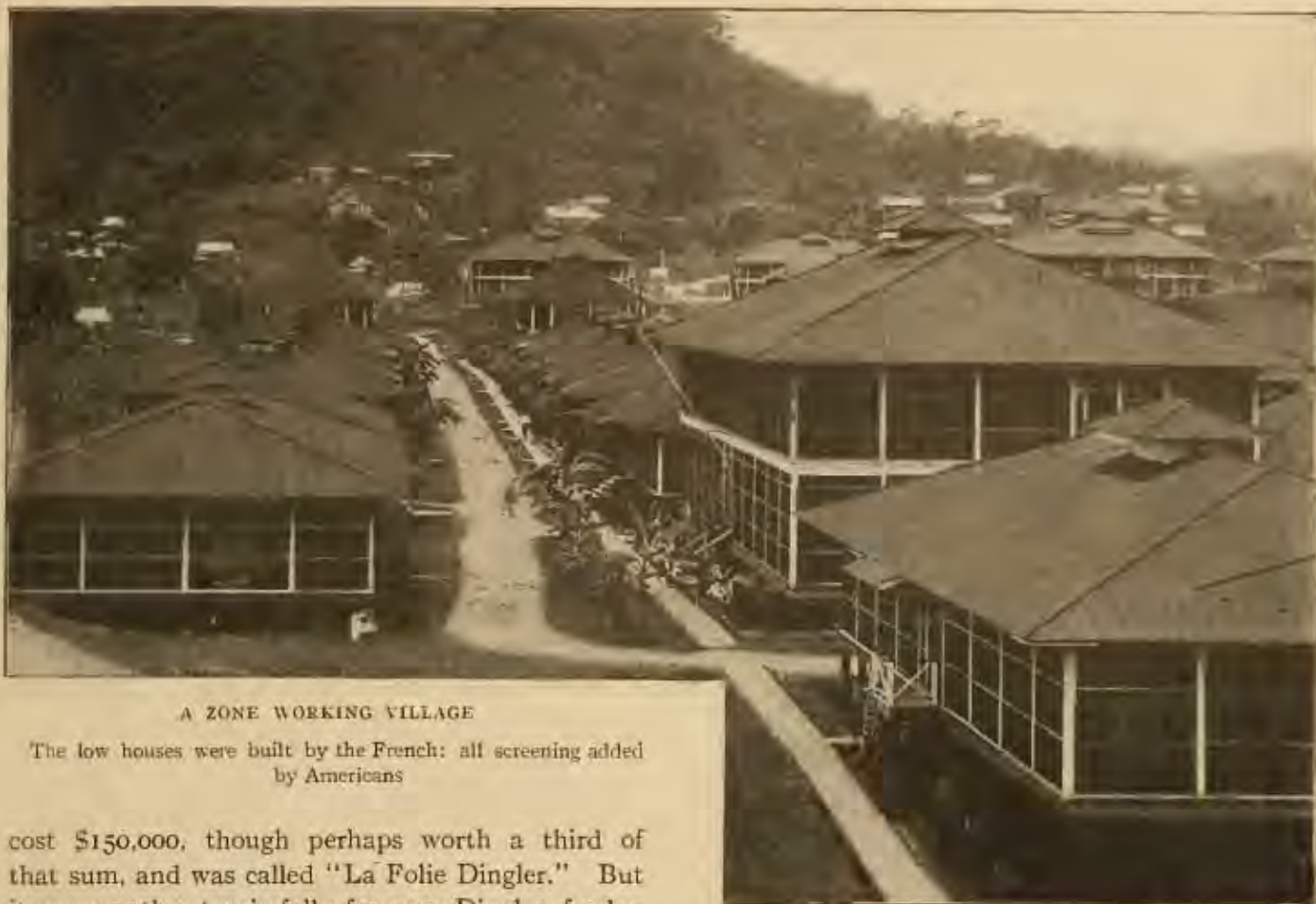
A ZONE WORKING VILLAGE

The low houses were built by the French: all screening added by Americans