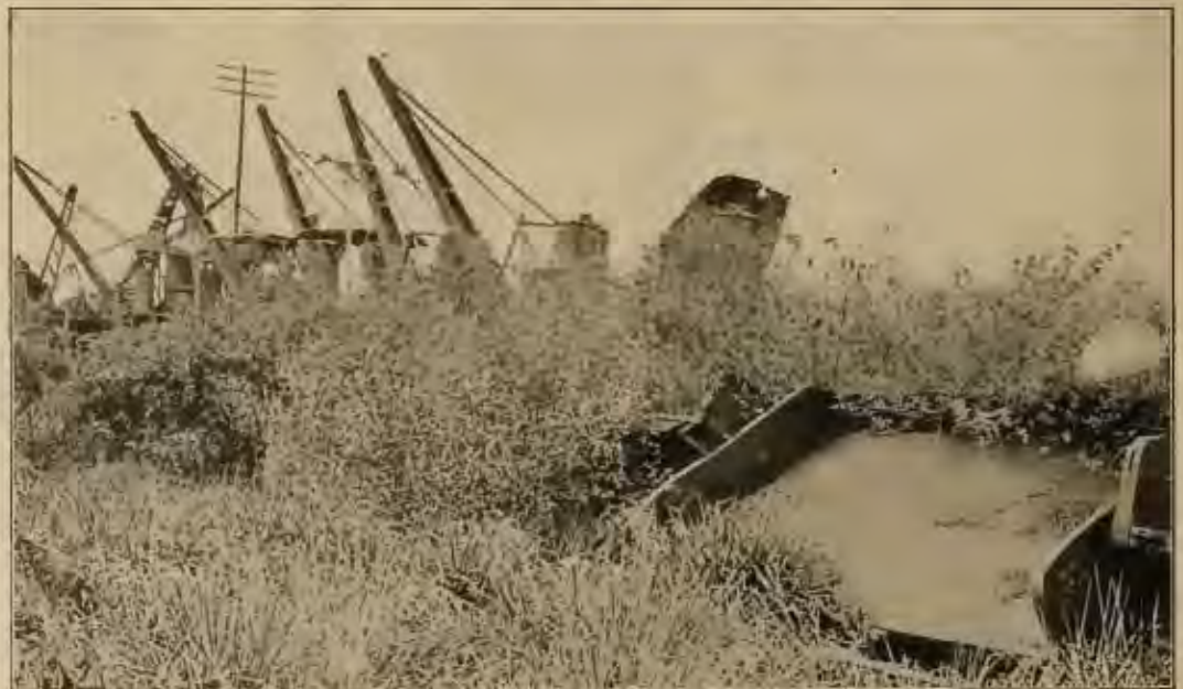
MACHINERY SEEMINGLY AS HOPELESS AS THIS WAS RECOVERED AND SET TO WORK

Immediately after the adjournment of the International Congress at Paris the stock of the canal company, $60,000,000 as a first issue, was offered to the investing public. It was largely over-subscribed. The French are at once a thrifty and an emotional people. Their thrift gives them instant