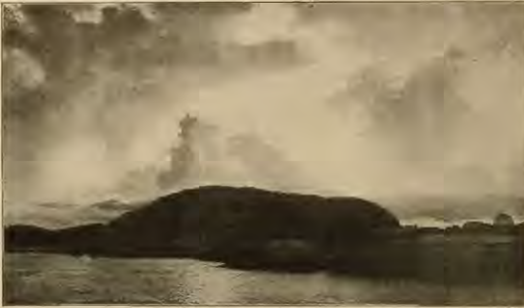
ANCON HILL AT SUNSET