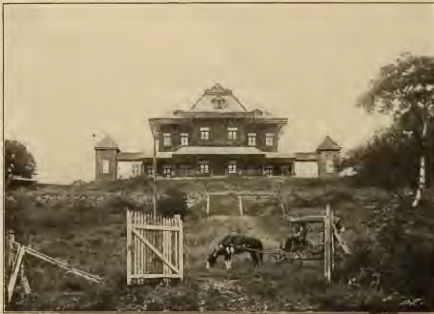
LA POLIE DINGLER

It has been the practice of many writers upon the canal to ridicule the unsuccessful effort of the French to complete it; to expatiate upon the theatrical display which attended their earlier operations, and the reckless extravagance which attended the period when the dire possibility of failure first appeared to their vision; to overlook the earnest and effective