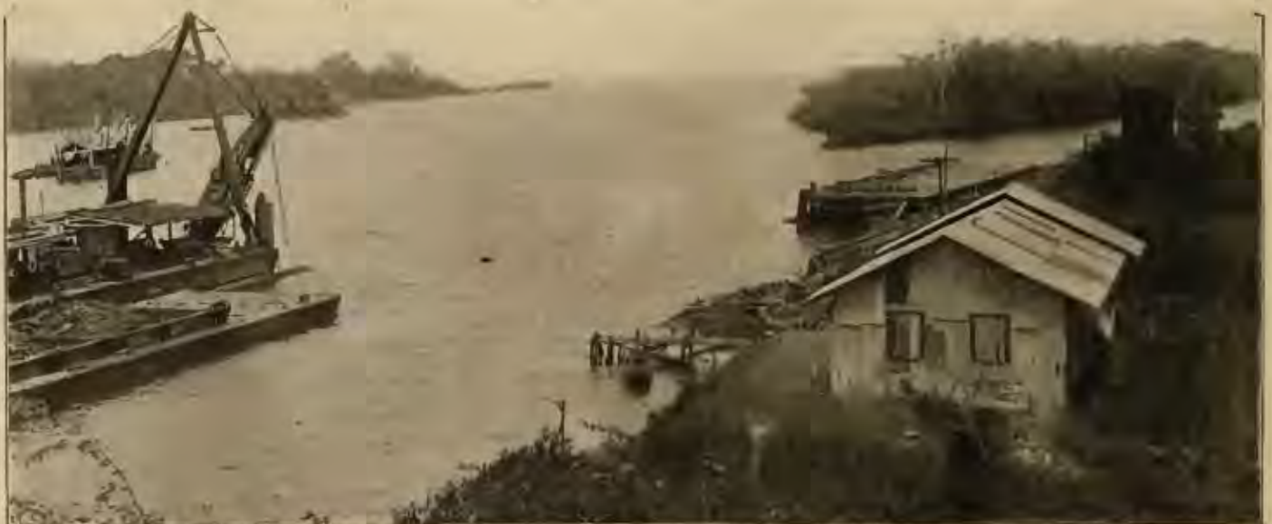
A view by Underwood &amp; Underwood

that no one thought of so material a thing as the tide. On the Pacific coast the tide rises and falls twenty feet or more, and while the guests were emptying their glasses the receding tide was emptying the bay whither they were bound. When they arrived they found that nearly two miles of coral rock and mud flats separated them from the shore where the