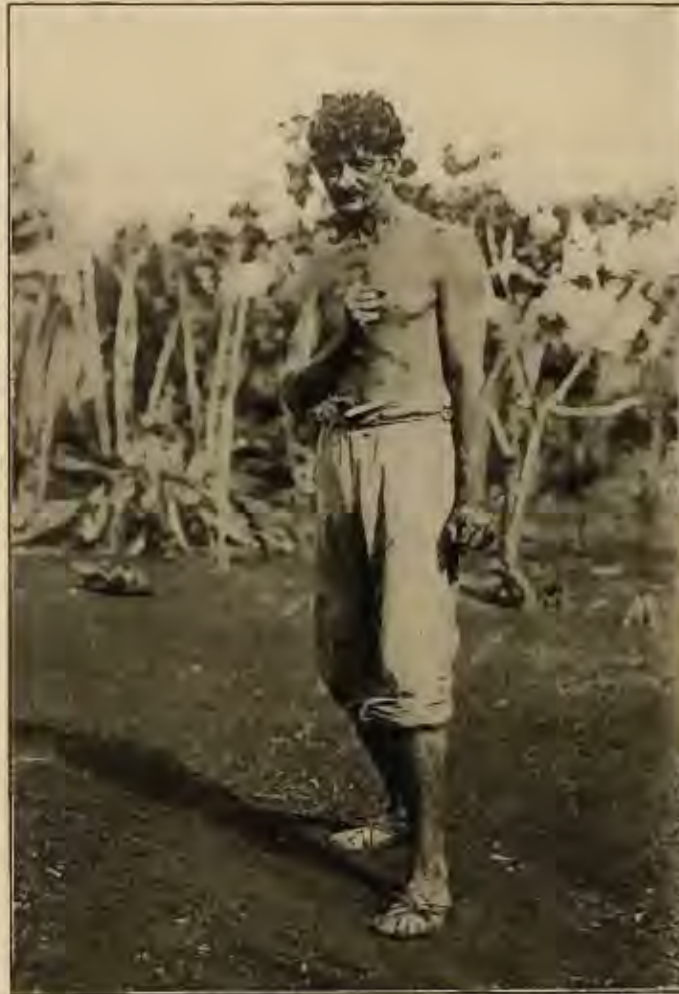
THE OFFICIAL UMPIRE, COCLE

The Isthmian Canal was precisely the great, epoch-marking spectacular enterprise to enlist the utmost enthusiasm and energy of this peculiarly dynamic President. A man of strong convictions he favored the Panama route—and got it. He believed in a lock canal—and enforced his beliefs over the report of the engineers whose expert professional opinions he invited. Of a militant tempera-