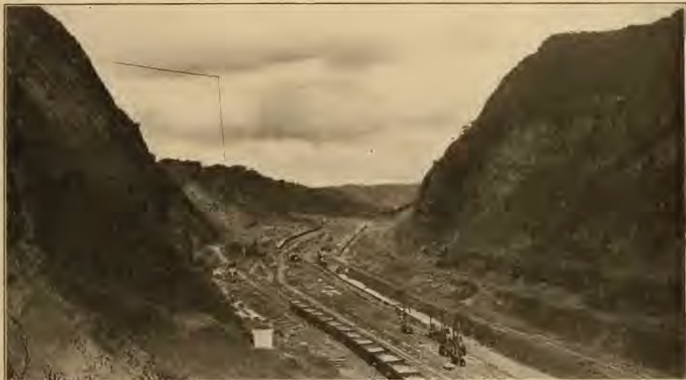
WHERE THE FRENCH DID THEIR BEST WORK

largely by our force in carrying material for the Gatun dam. At the Pacific entrance they had dug a narrow channel three miles long which we are still using. We paid the French company $40,000,000 for all its rights on the Isthmus. There are various rumors as to who got the money. Some, it is believed, never went far from New York, for with all their thrift the French are no match for our high financiers. But whoever got the money we got a good bargain. The estimate of our own commission