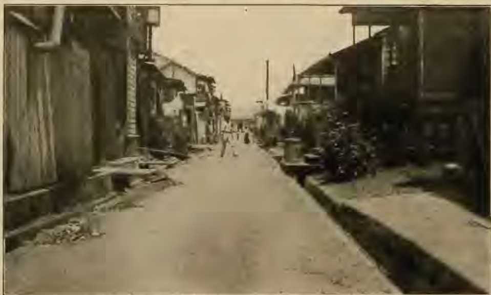
NEGRO QUARTERS, FRENCH TOWN OF EMPIRE Paving and sanitary arrangements due to American régime

two towns as full of easy money as a mining camp after a big strike. The pleasures of such a society are not refined. Gambling and drinking were the less serious vices. A French commentator of the time remarks, "Most of the com-